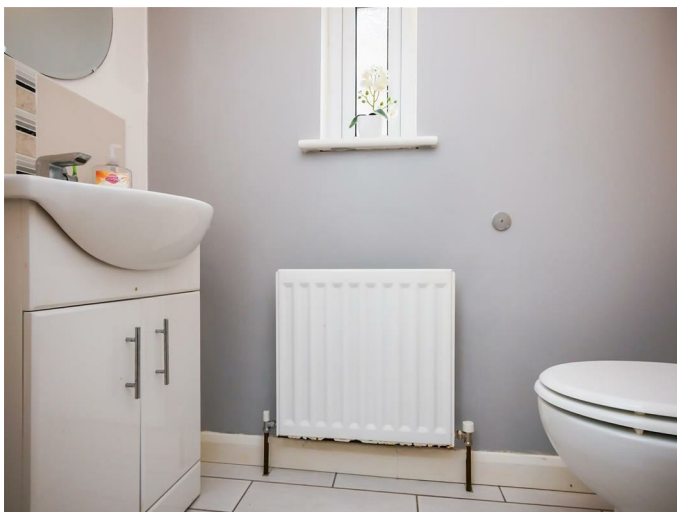
Low flush w.c sink unit with mixer taps with storage below. Tiled flooring.