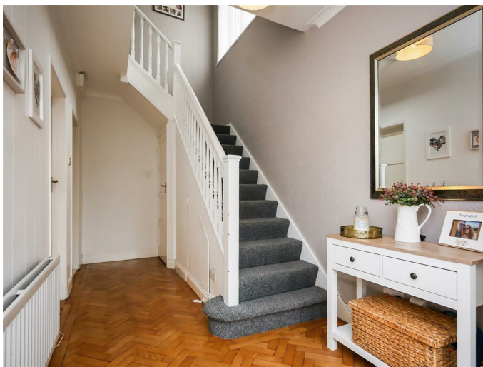
Composite front door with glazed side panels to entrance hall. Tiled flooring and wood stripped flooring.