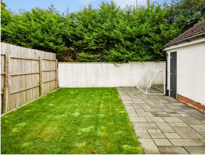
Enclosed rear with flagged patio and garden laid in lawn.