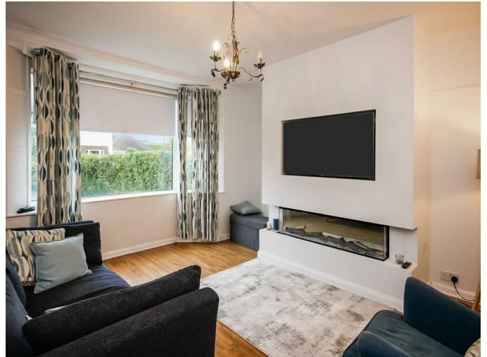
(into bay) Raised contemporary glass fronted electric fire with living flame with space for recessed TV. Laminate flooring.