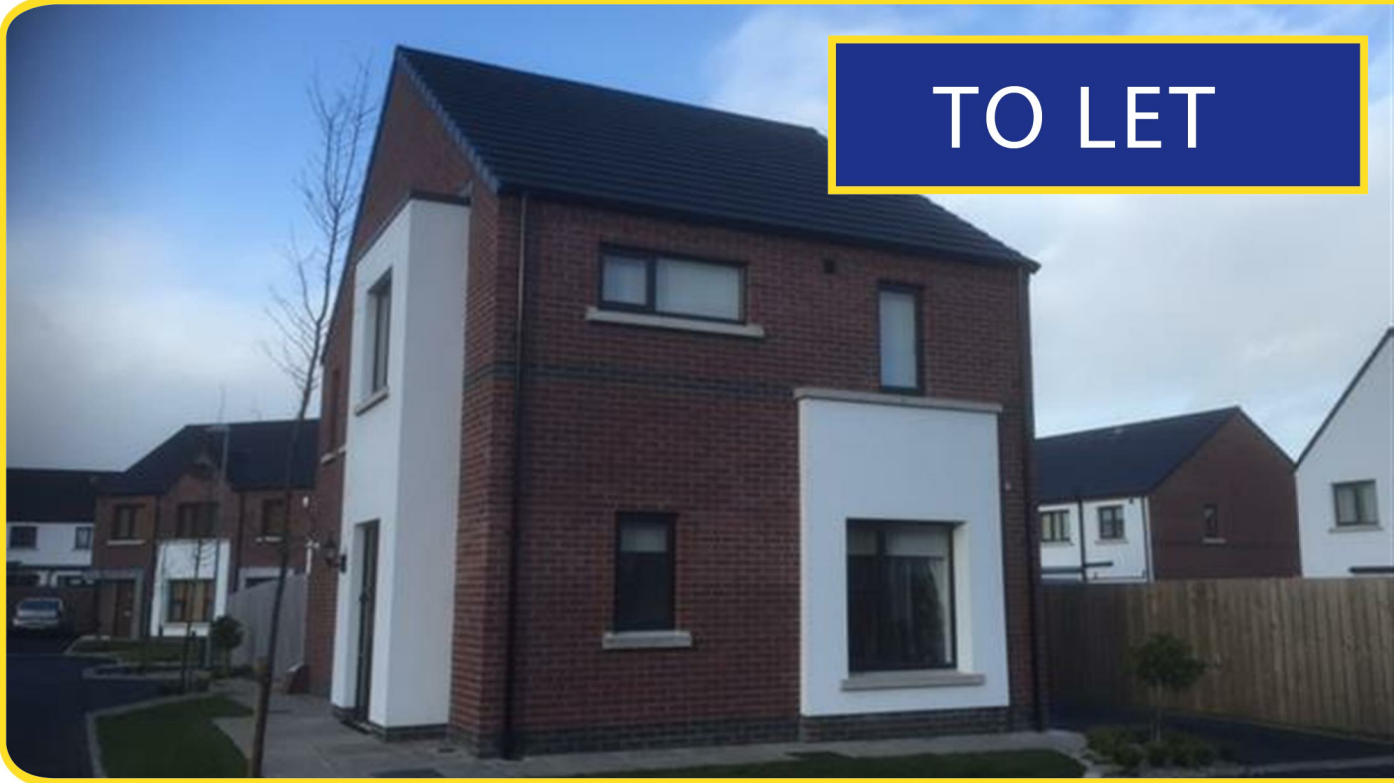
14 Brighter Gardens, Limavady, BT49 0GH