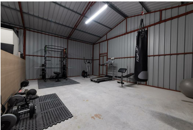
Corrugated detached garage with electric roller door. Light and power.