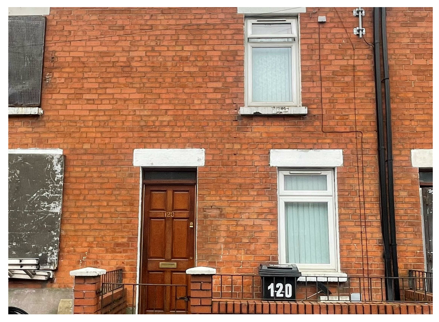
120 Benburb Street, Belfast, BT12 6JJ