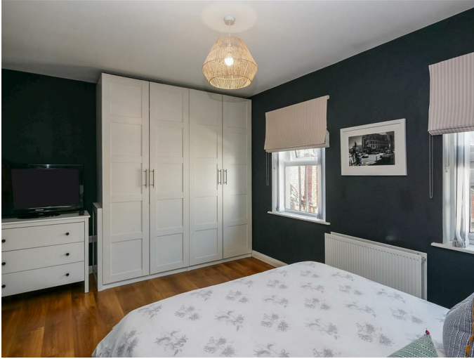
Bedroom Two 14'5 x 8'9 (4.39m x 2.67m)