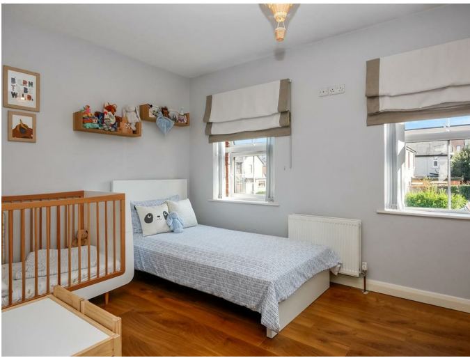
(at widest points) Laminate flooring.