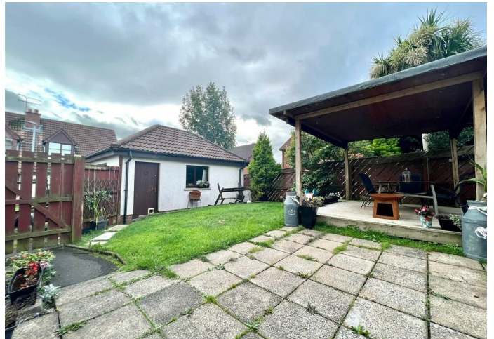
DETACHED GARAGE 12'6" x 17'11"

Roller shutter door, power & light, plumbed for washing machine.