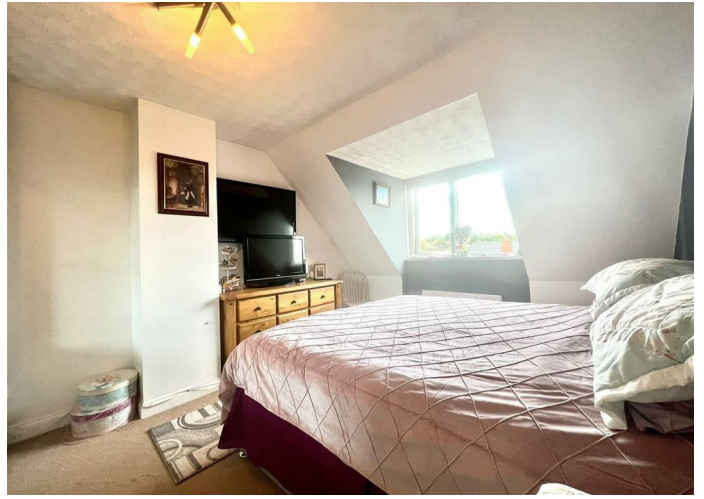
BEDROOM 2 10'11" x 10'9"