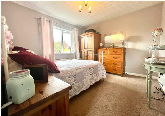
BEDROOM 1 14'2" x 10'8" (Into eaves)