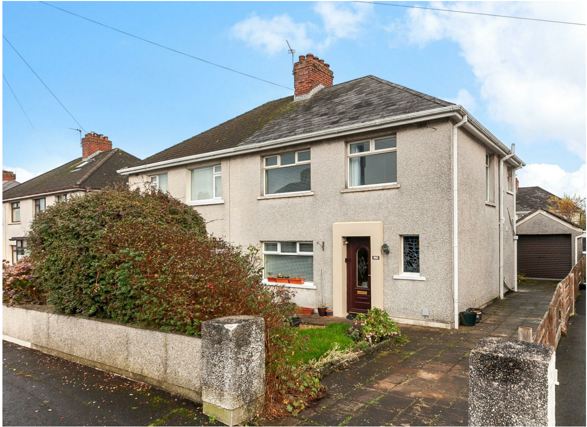
17 Swanston Gardens, Newtownabbey, BT36 5DR