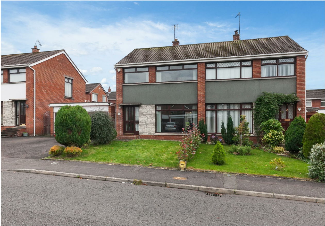
11 Castleton, Templepatrick, Ballyclare, BT39 0AZ