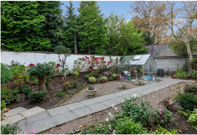
Communal garden areas, residents & visitor parking.