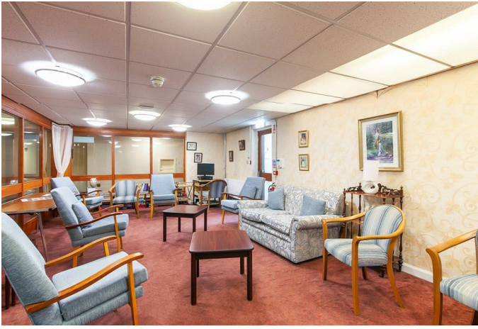
Communal living area for residents to socialise. Laundry room.