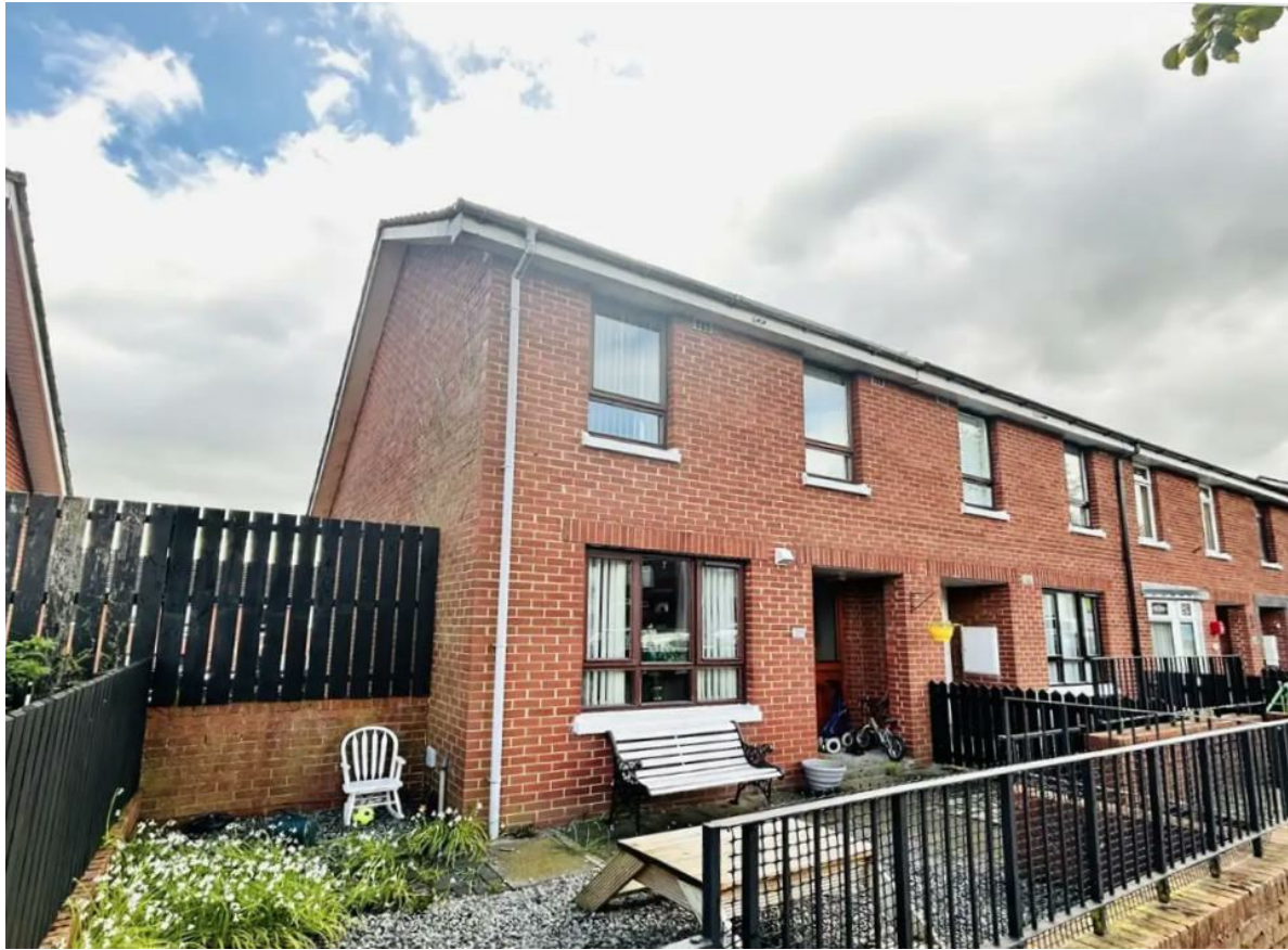
339 North Queen Street, Belfast, BT15 1HS