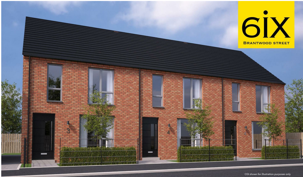
CGI shown for illustration purposes only