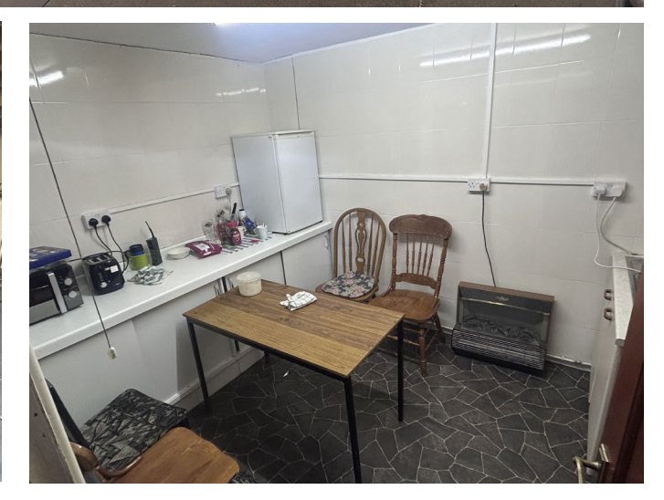
Avison Young | Unit 14A, Avondale Industrial Estate, Ballyclare – To Let