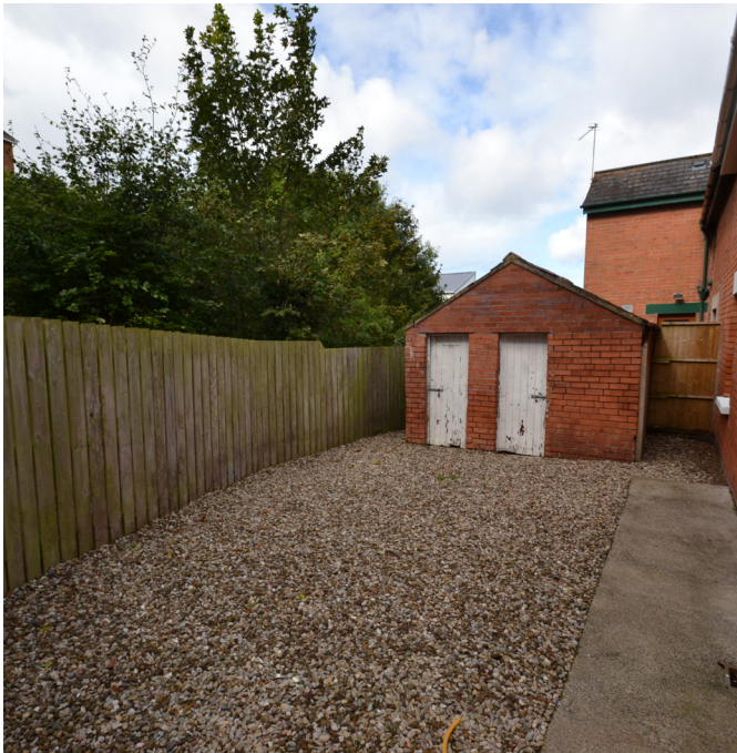
Enclosed rear garden