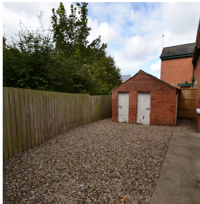
Enclosed rear garden