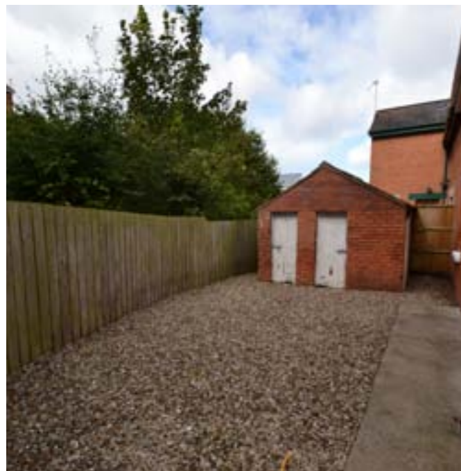
Enclosed rear garden