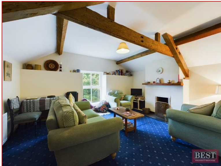
Former outbuilding converted to a 3-bed flat.