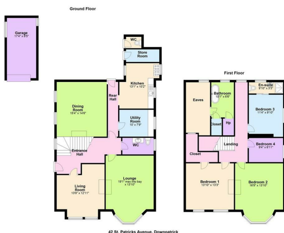
42 St. Patricks Avenue, Downpatrick

Terms & Conditions: Please note that these particulars do not constitute an offer or contract of sale. Any prospective purchaser should satisfy themselves by thorough inspection of the property and we recommend that any prospective purchaser should employ the professional services of a building surveyor and consider their findings prior to entering into contract. All such fees associated with this work will be the responsibility of the prospective purchaser regardless of whether the sale completes or not. In addition, none of the appliances or installations have been tested in any way whatsoever and it is our recommendation that a purchaser should fully satisfy themselves by employing an appropriate expert. We would also like to advise that our measurements are taken from the widest points of each room and should not be relied upon as completely accurate. You should not make decisions based on the measurements provided and double check measurements at all times. Valuation/Mortgage Service: As part of our service we would remind Vendors and potential purchasers that we have a Mortgage Broker available at this branch. If you are thinking of selling, we would be happy to carry out a free market appraisal of your property.