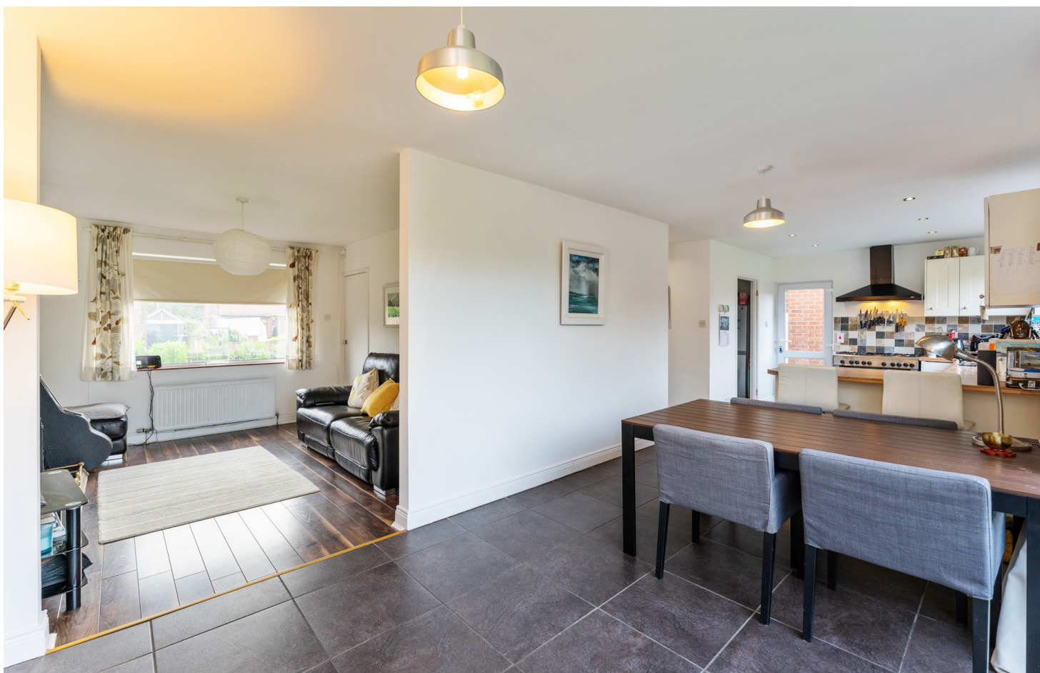
Open to living room also