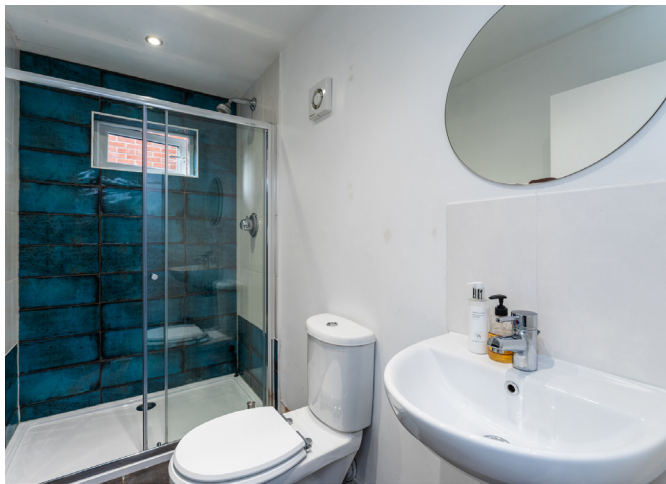
Ground floor shower room