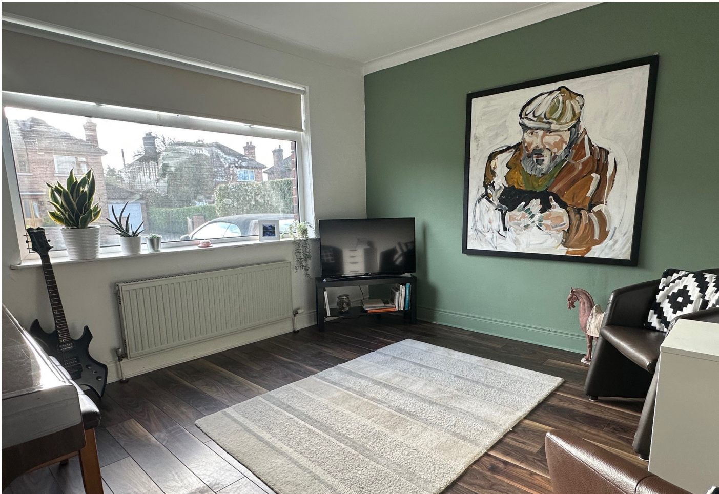
Sitting room or downstairs bedroom 4