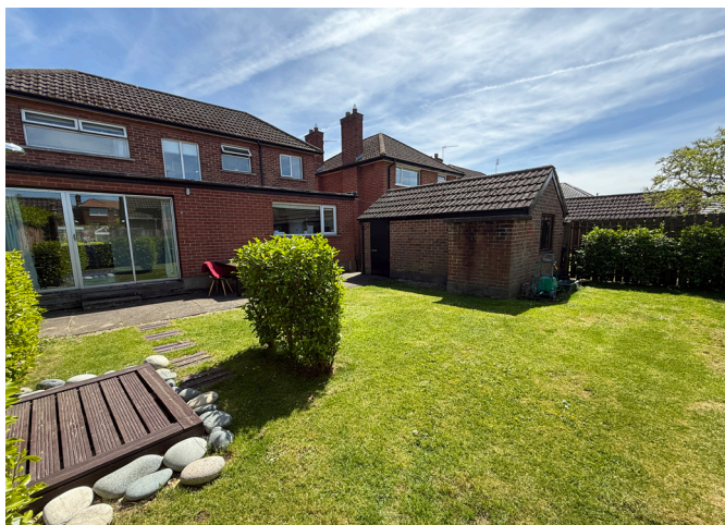
Sunny rear garden with outdoor shower

THIS INFORMATION IS FOR GUIDANCE ONLY AND IS NOT EXHAUSTIVE