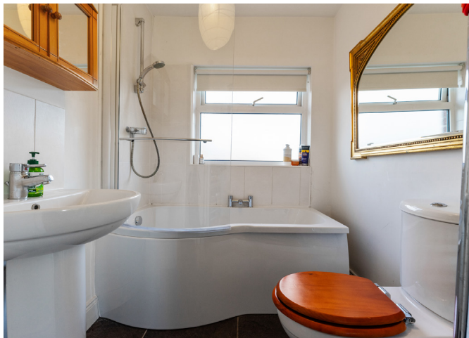
First floor bathroom