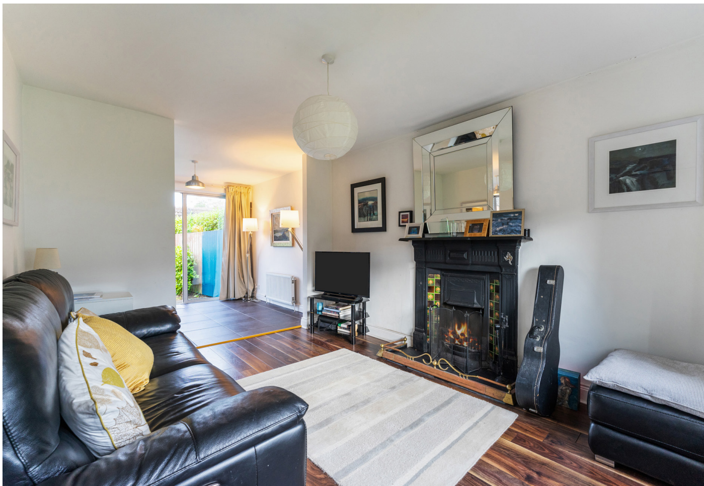
Living room leading to open plan dining kitchen and back garden