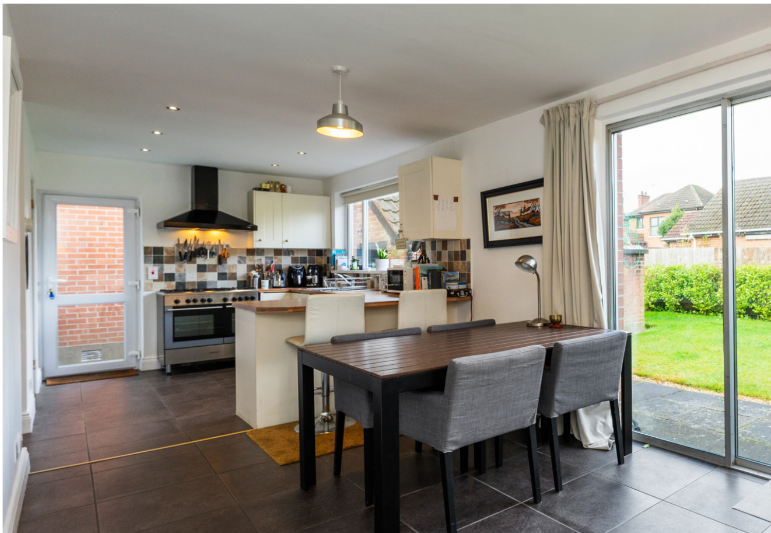
Bright open plan kitchen dining space