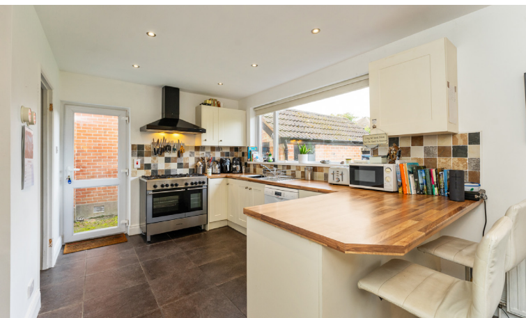
Breakfast bar to kitchen area

SHOWER ROOM: 8' 6" x 4' 3" (2.59m x 1.3m) White suite comprising low flush wc, pedestal wash hand basin, extractor fan, recessed lighting, tiled floor, fully tiled, thermostatically controlled shower cubicle, chrome heated towel radiator.