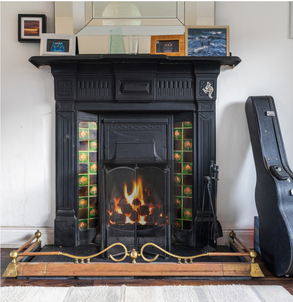
Period style cast iron and tiled fireplace