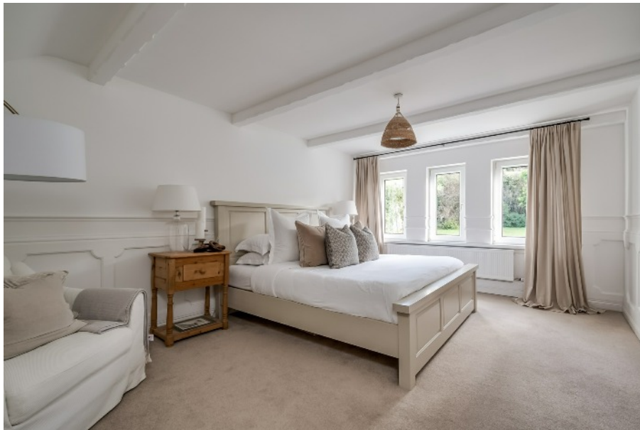
BEDROOM (4): 12' 6" x 7' 9" (3.81m x 2.36m)