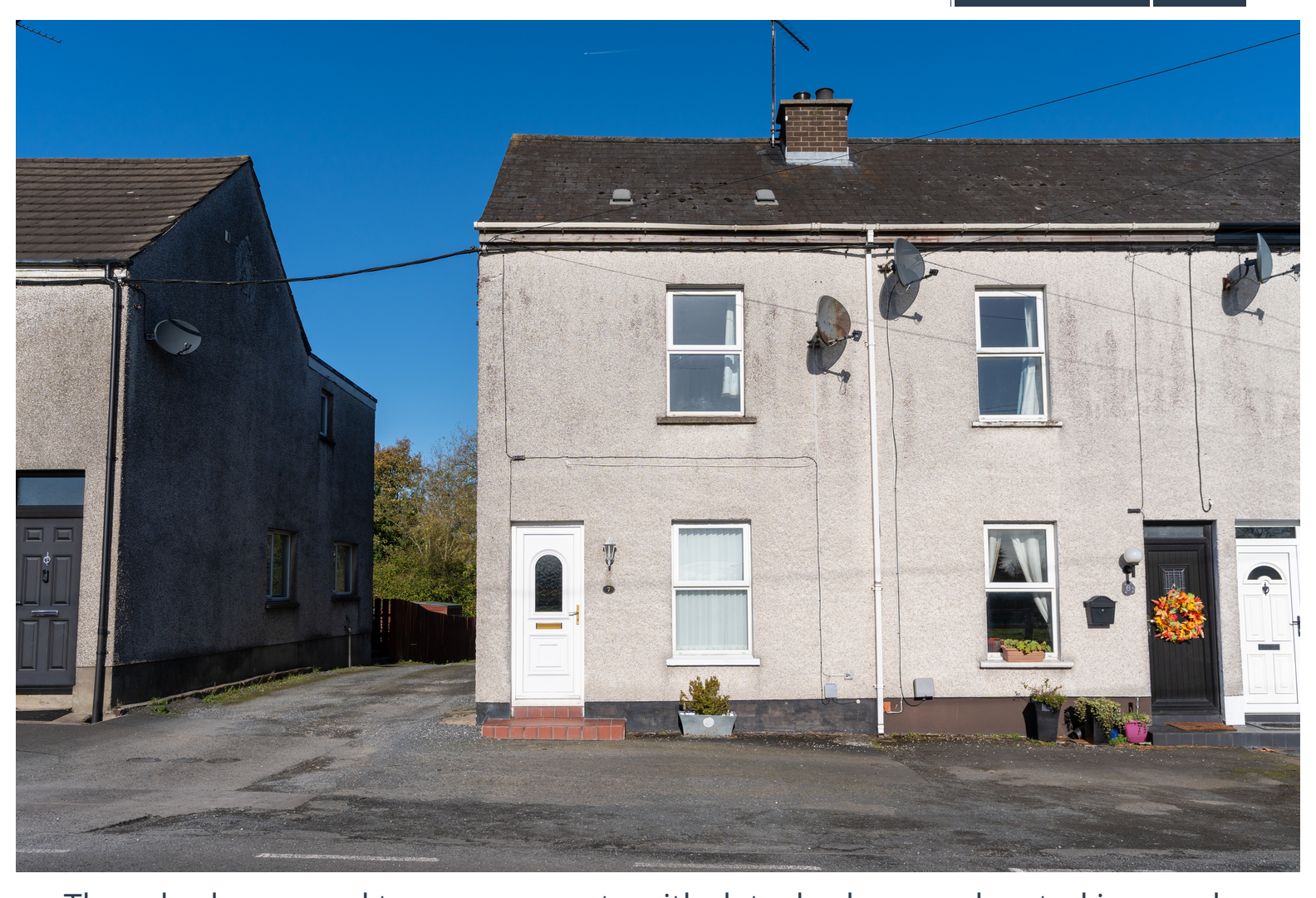
Three bedroom end terrace property with detached garage located in popular Drumnacanvy area