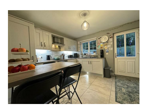
50 Fairview Farm Road Doagh Road, Ballyclare, BT39 9LB