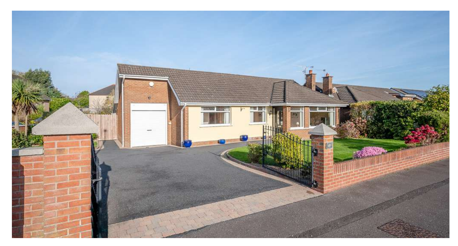
DETACHED BUNGALOW | 3 ⊨ | 1 ≒ | 2 ⊟

Here is an ideal opportunity to purchase an attractive detached bungalow located in this extremely popular residential area with no onward chain.