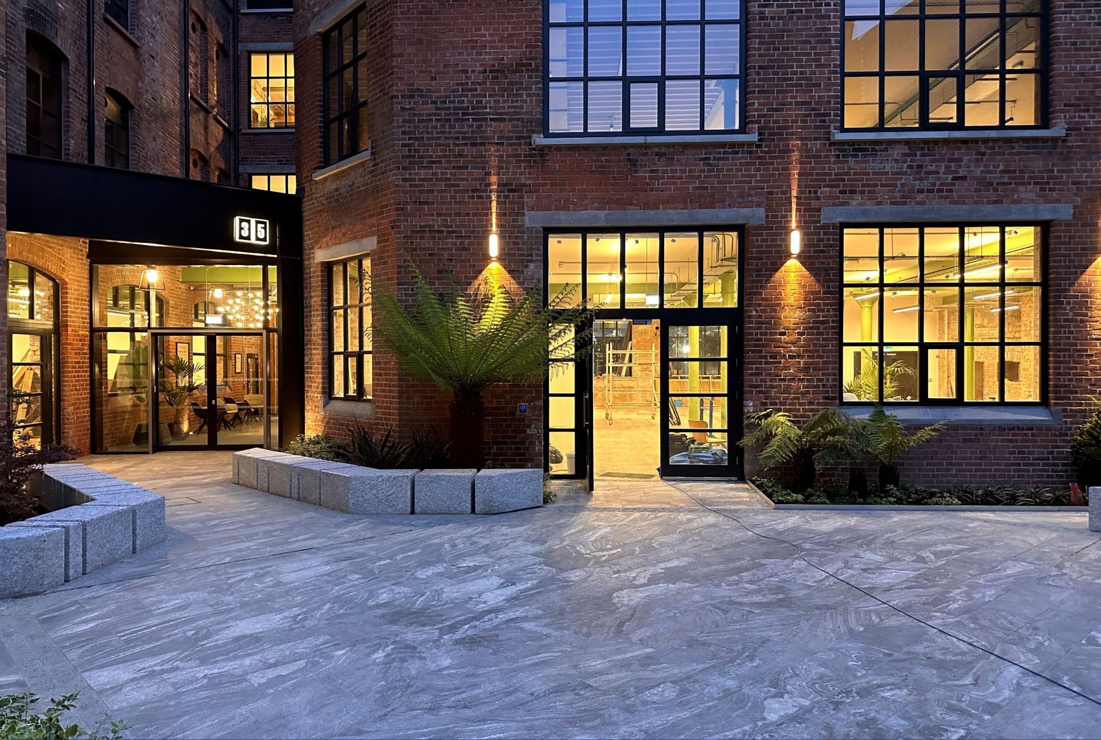
THE PRINTWORKS, 35-39 QUEEN STREET, BELFAST, BT1 6EA