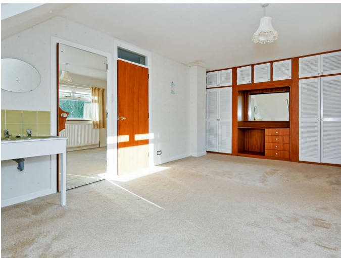
Sink unit. Built in bedroom furniture. Storage area.