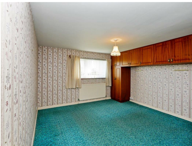
Built in bedroom furniture.