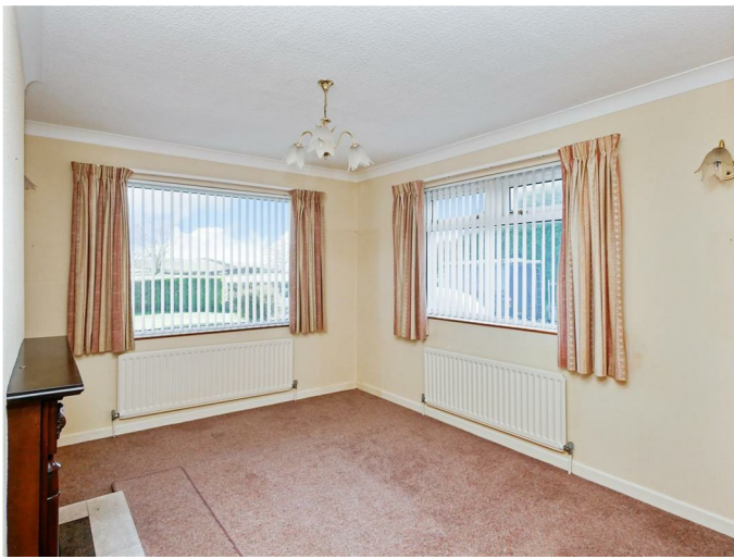
Fire place with wooden surround.