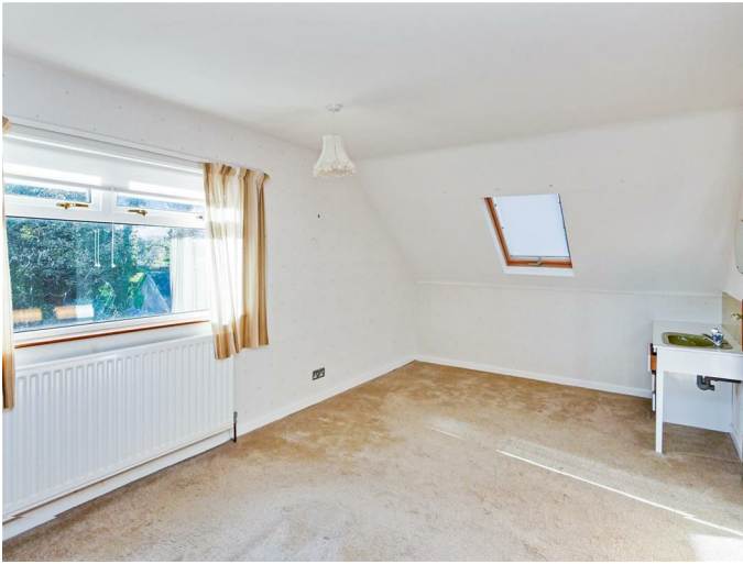
Bedroom Two 17'3 x 11'5 (5.26m x 3.48m)