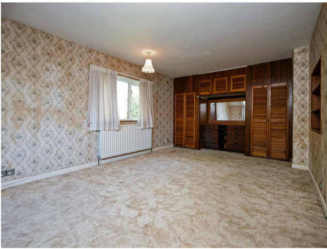
Built in bedroom furniture.