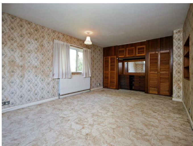
Built in bedroom furniture.