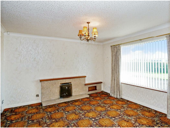
Tiled fire-place housing an open fire.