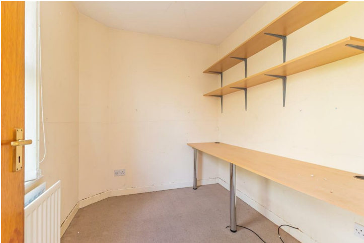
Study 6'5" x 7'5"