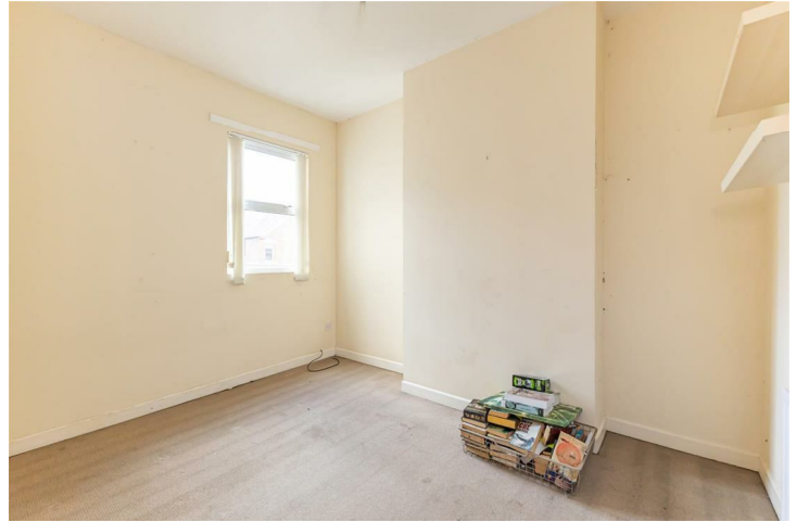
Bedroom 2 8'2" x 11'0"

The first floor master bedroom includes a bay window that floods the space with natural light and also features a fireplace. This bedroom has also has an ensuite measuring 5'2" x 11'0".