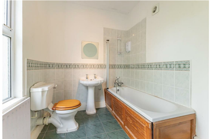
First Floor Bathroom 6'5" x 7'5"

3 piece bathroom suite which includes a bath with an overhead shower. Tiled flooring and part tiled walls.