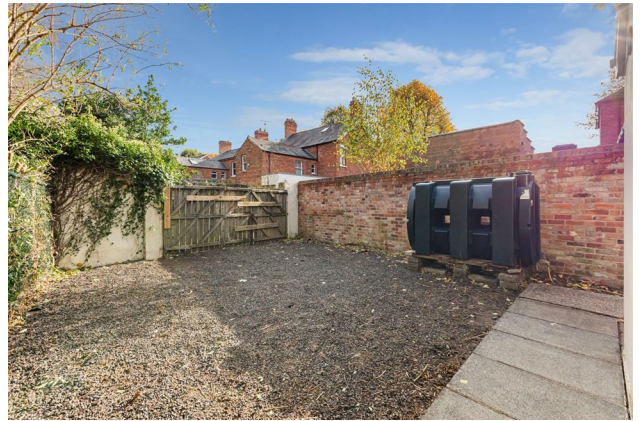
Enclosed Rear Yard