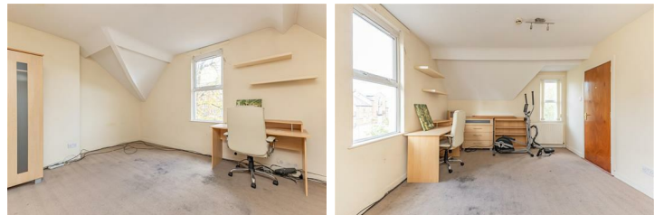
Bedroom 3 14'8" x 11'6"

Spacious, second floor bedroom to the front of the house.