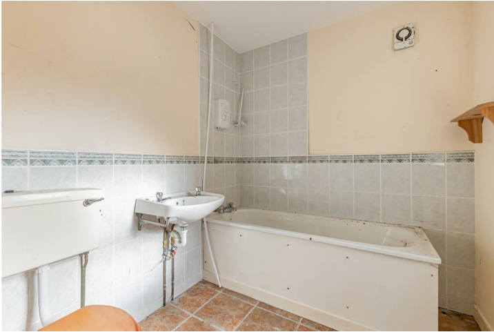
Ground Floor Bathroom 6'5" x 6'6"

The first floor, 3 piece bathroom suite includes a bath with an overhead shower. Tile flooring and part tiled walls.