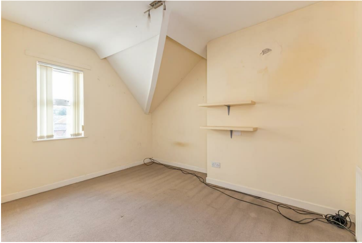
Bedroom 4 8'2" x 11'0"