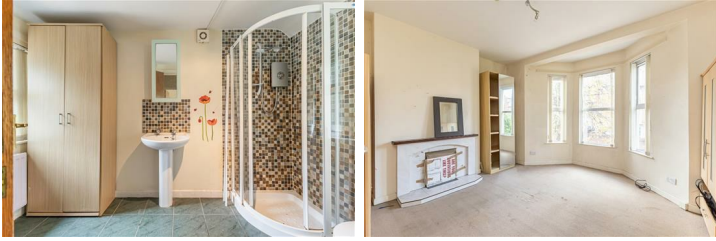
Bedroom 1 14'8" x 14'0"

The first floor master bedroom includes a bay window that floods the space with natural light and also features a fireplace. This bedroom has also has an ensuite measuring 5'2" x 11'0".