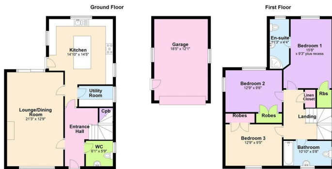
19 Cumber Road, Drumaness

Terms & Conditions: Please note that these particulars do not constitute an offer or contract of sale. Any prospective purchaser should satisfy themselves by thorough inspection of the property and we recommend that any prospective purchaser should employ the professional services of a building surveyor and consider their findings prior to entering into contract. All such fees associated with this work will be the responsibility of the prospective purchaser regardless of whether the sale completes or not. In addition, none of the appliances or installations have been tested in any way whatsoever and it is our recommendation that a purchaser should fully satisfy themselves by employing an appropriate expert. We would also like to advise that our measurements are taken from the widest points of each room and should not be relied upon as completely accurate. You should not make decisions based on the measurements provided and double check measurements at all times. Valuation/Mortgage Service: As part of our service we would remind Vendors and potential purchasers that we have a Mortgage Broker available at this branch. If you are thinking of selling, we would be happy to carry out a free market appraisal of your property.