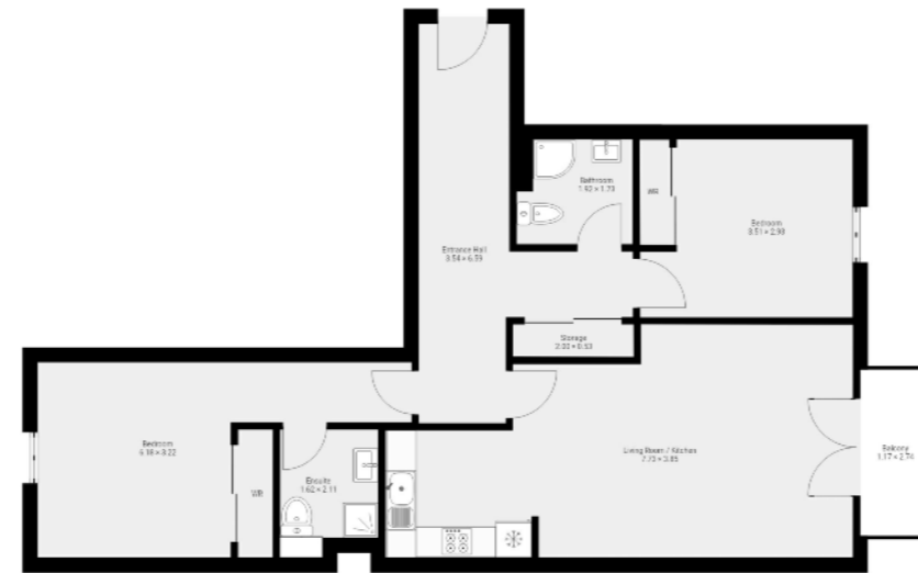
THIS FLOORPLAN IS PROVIDED AS AN ILLUSTRATION ONLY