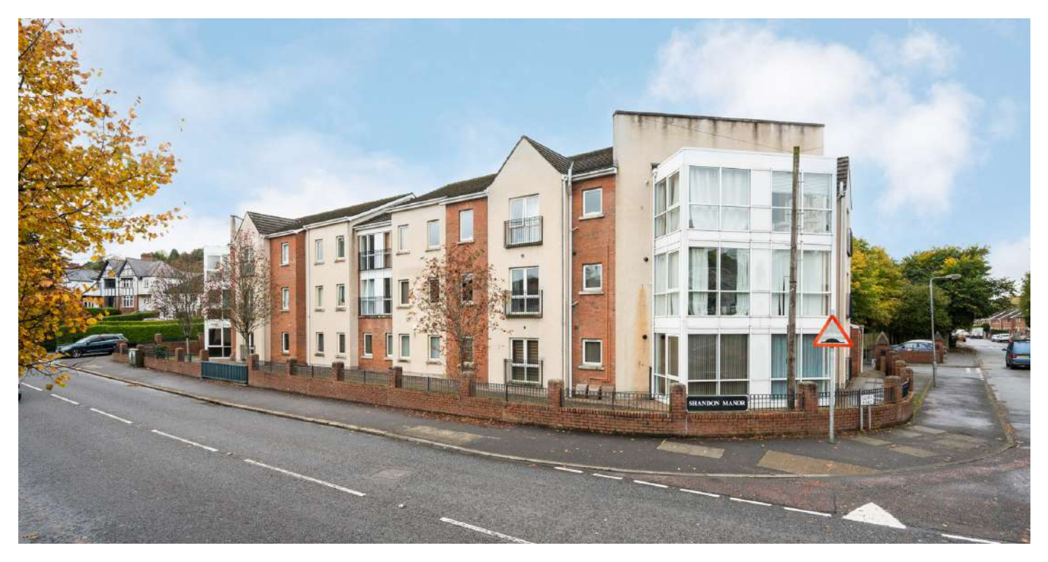
GROUND FLOOR APARTMENT | 2 \boxminus | 1 \leftrightarrows | 1 \boxminus

Shandon Manor is an exclusive development of apartments located off the prestigious Sandown Road in East Belfast.