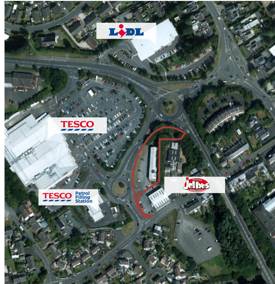
Not To Scale. For indicative purposes only.

The property is registered for VAT. It is anticipated that a sale will be treated as a Transfer of Going Concern (TOGC).