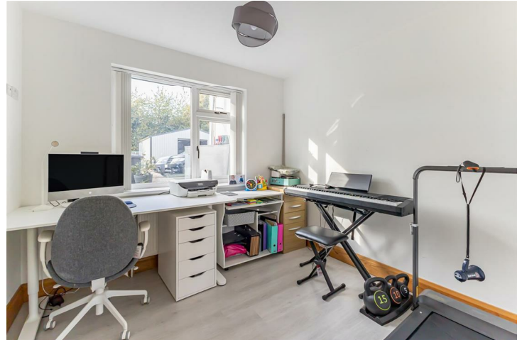
Bedroom 2 9'3" x 8'7".

A rear facing single bedroom with laminate flooring. Could potentially be utilised in a different way, for example an office, child's nursery or dressing room.