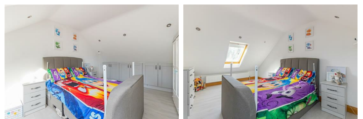
Bedroom 4 17'10" x 11'0".

A bright and spacious bedroom with laminate flooring and bespoke built in cupboards providing excellent storage.