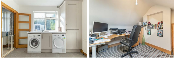
Utility Room 10'7" x 9'8"

A spacious utility room with tile flooring, featuring modern high and low-rise units with a durable laminate worktop. It is equipped with connections for both a washing machine and tumble dryer. The room also offers access to an office space via a loft ladder.