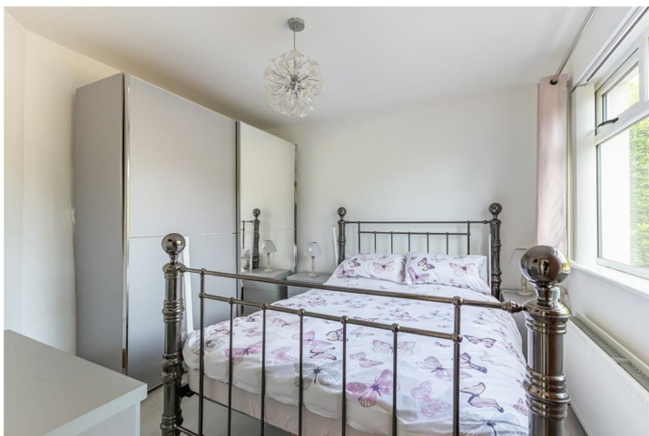
Bedroom 1 10'7" x 10'9".

A bright and spacious front facing double bedroom with laminate flooring.