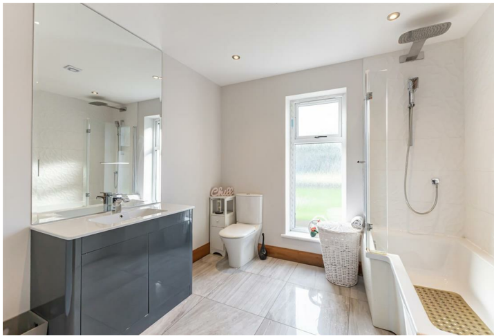
Family Bathroom 9'0" x 8'7".

An elegantly designed, contemporary three-piece bathroom suite featuring a large bath with an overhead shower, complemented by high quality sanitary ware and a stylish vanity unit.