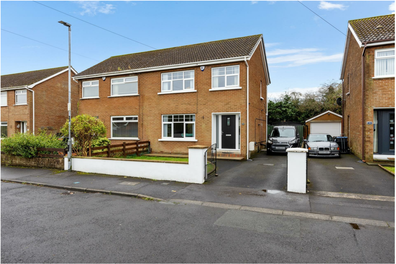
33 Knockview Road, Newtownabbey, BT36 6TT