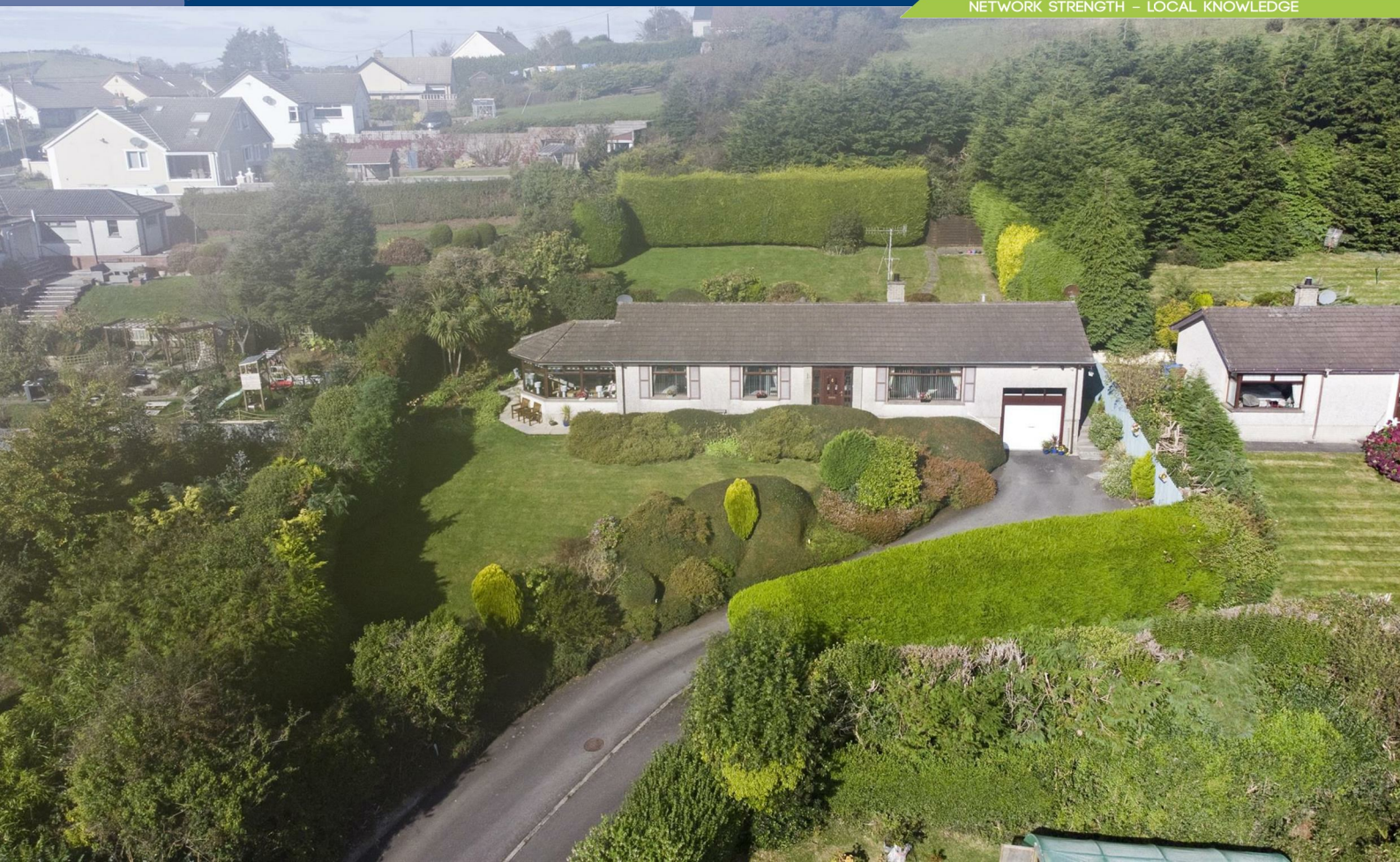
4 ROUGHAL PARK, DOWNPATRICK, BT30 6HB