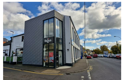
Regus Kilmorey Street Newry, BT34 2DE