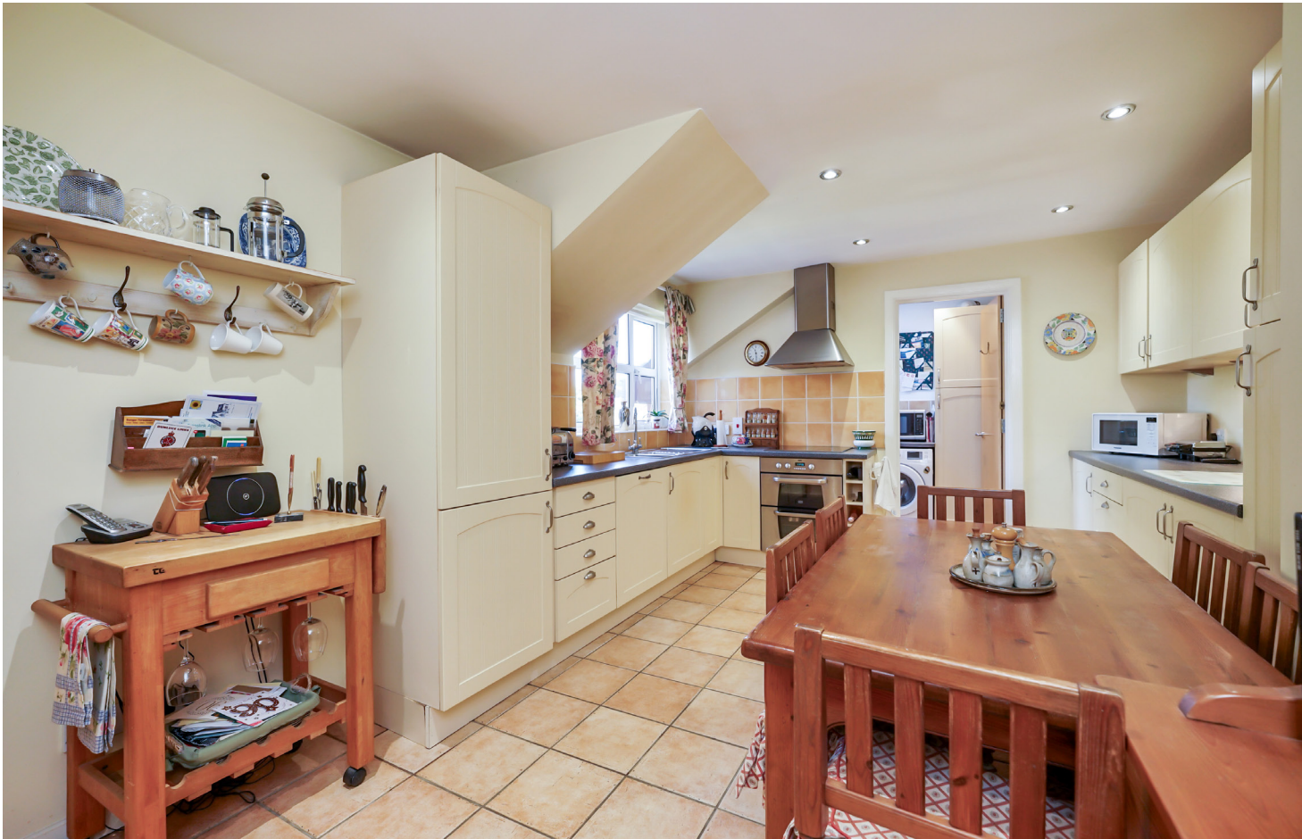
Space for dining