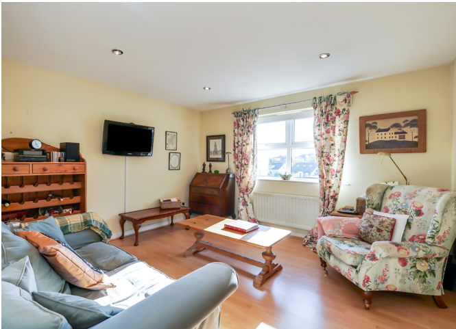
Bedroom two (presently sitting room) en suite shower room