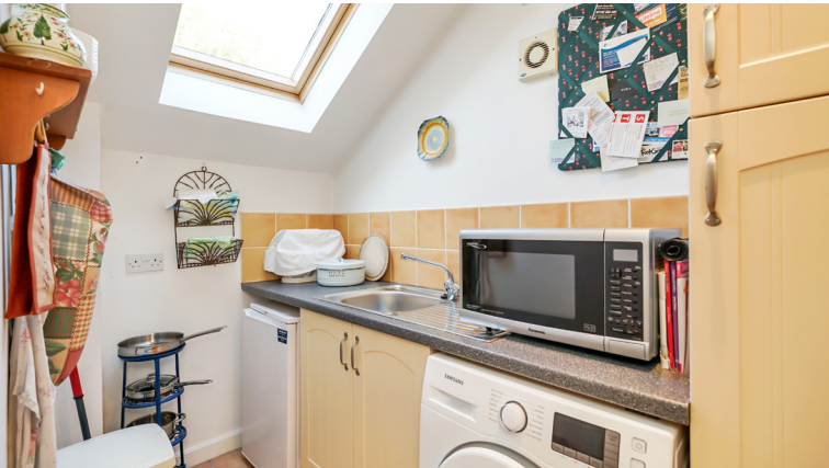
Separate utility room