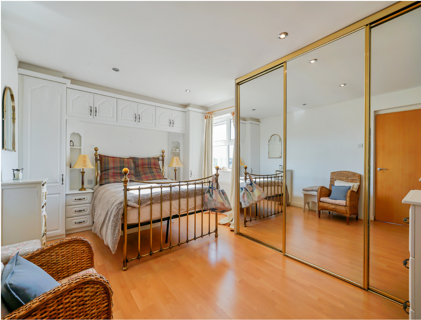
Bedroom one with range of wardrobes

BEDROOM (1) 16' 0" x 11' 6" (4.88m x 3.51m) Extensive range of built-in wardrobes, sliding mirror doors, beech laminate flooring, additional built-in wardrobes, built-in cupboards and built-in drawers, recessed lighting.