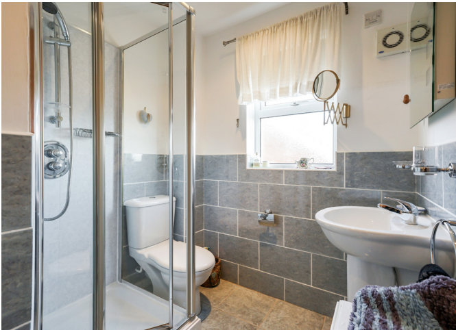
Ensuite shower room