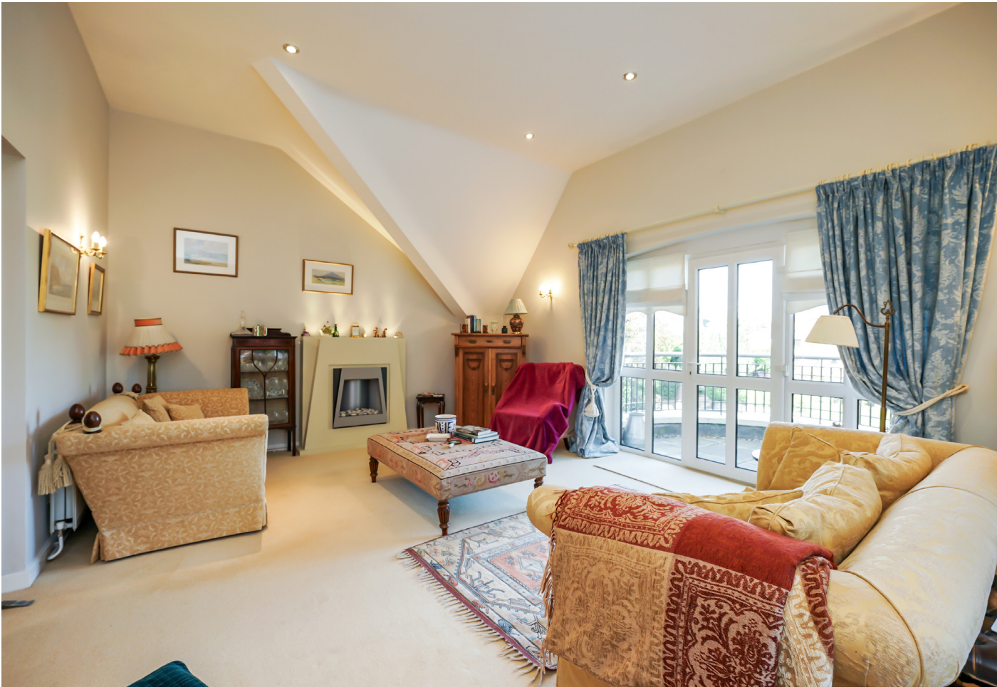
Drawing room with balcony off