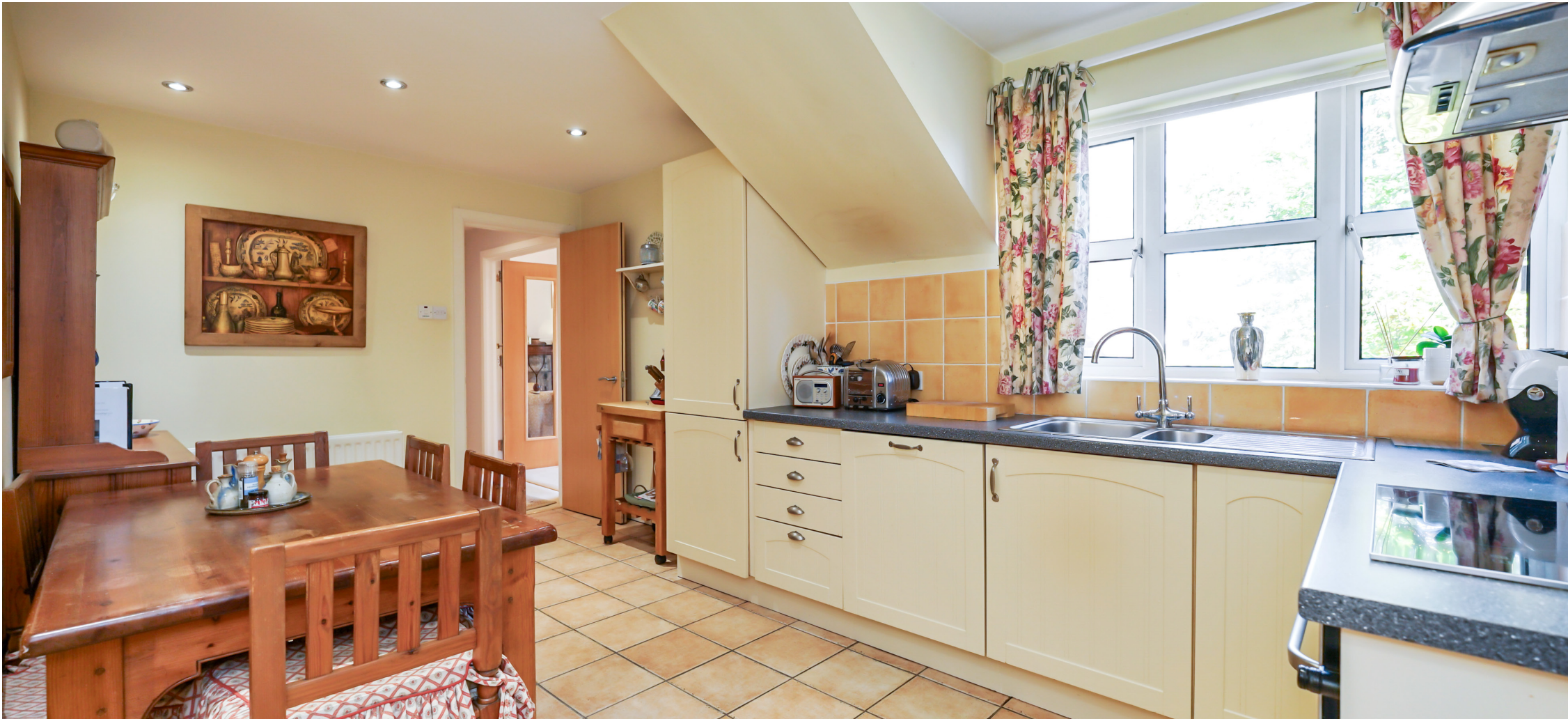
Shaker style kitchen