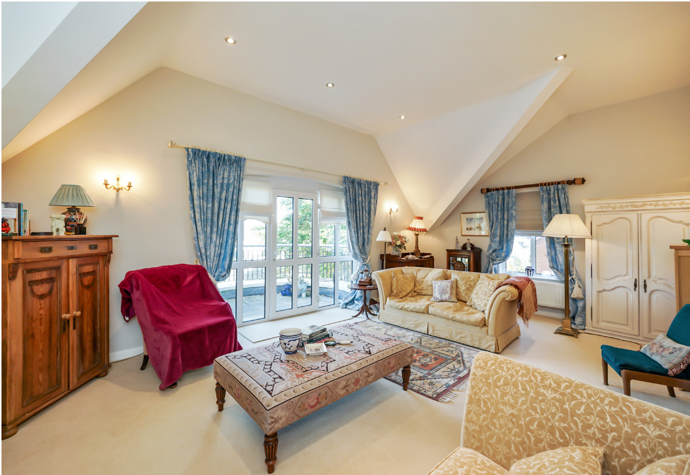
Drawing room with vaulted ceiling