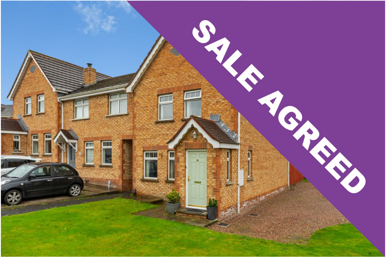
31 Viceroy's Wood, Bangor, BT19 1WF