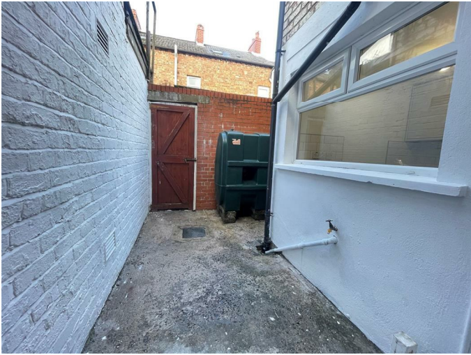
Enclosed yard to rear with outside light.