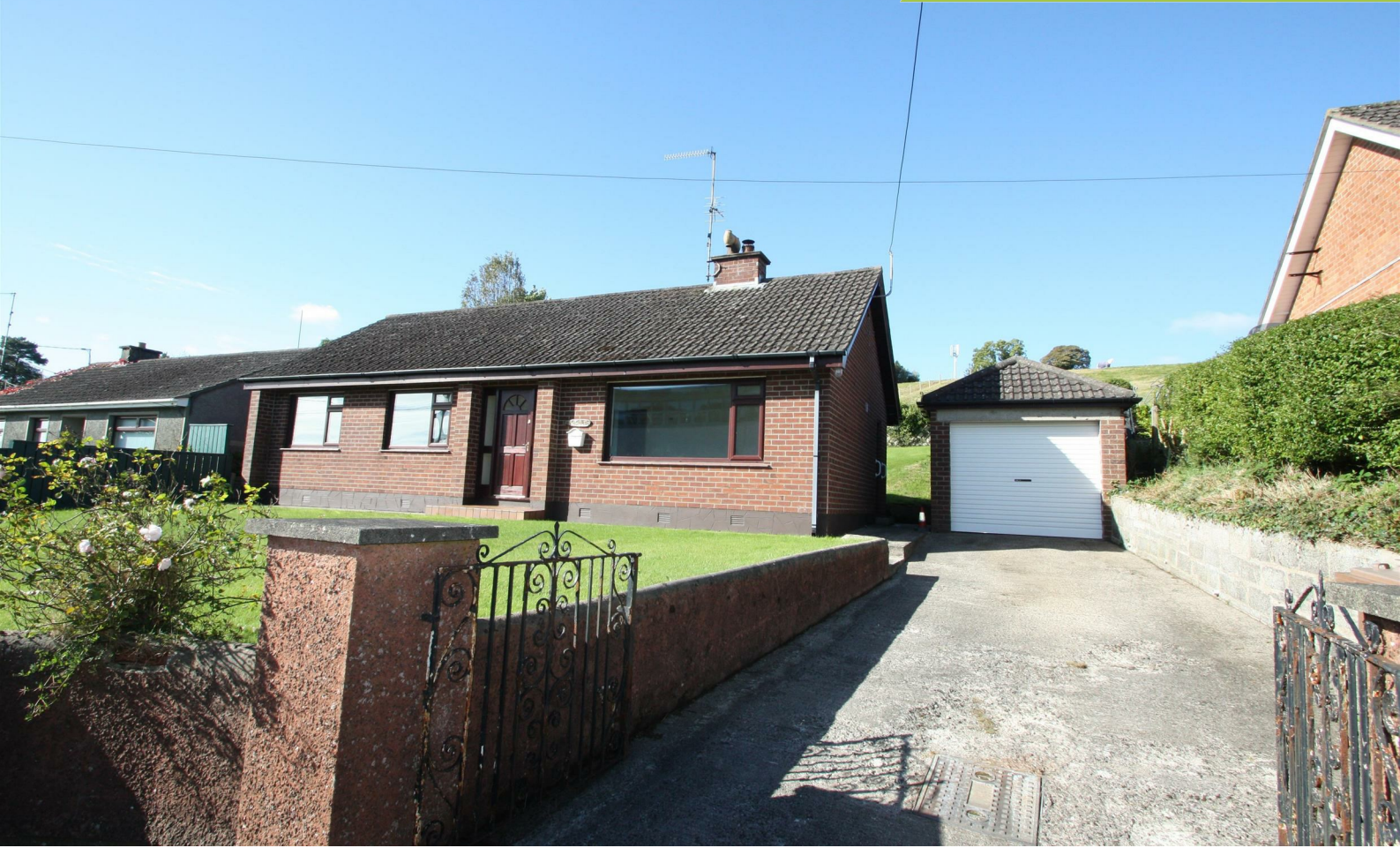
28 COMBER ROAD, SAINTFIELD, BALLYNAHINCH, BT24 7BB