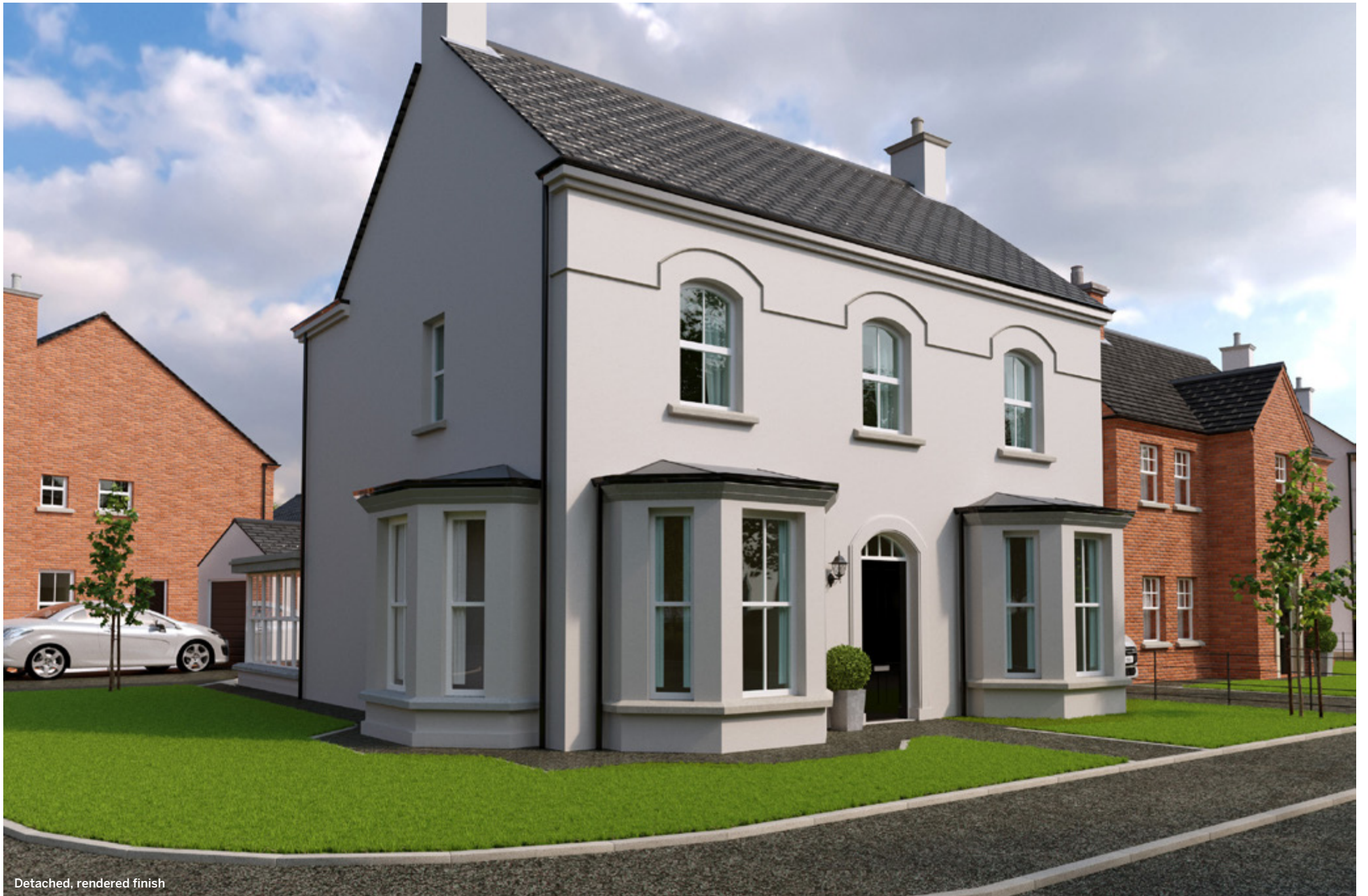
Detached, rendered finish