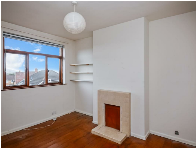
Tiled fireplace. Excellent views.