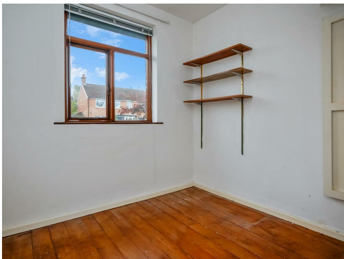
Built in robes.