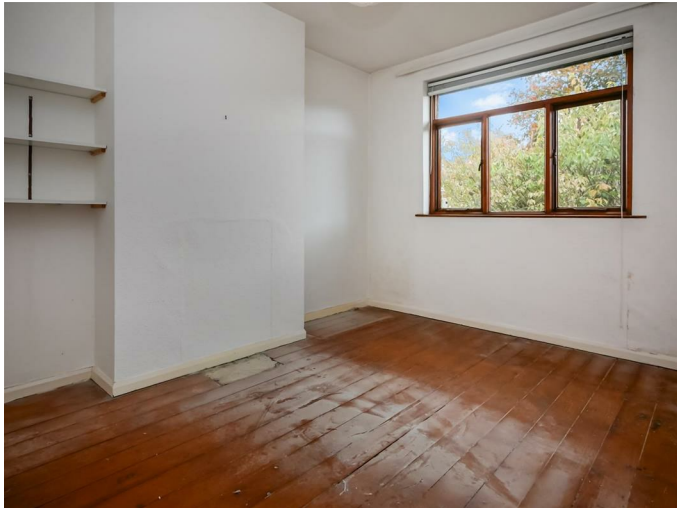
Bedroom Two 11'4 x 9'6 (3.45m x 2.90m)