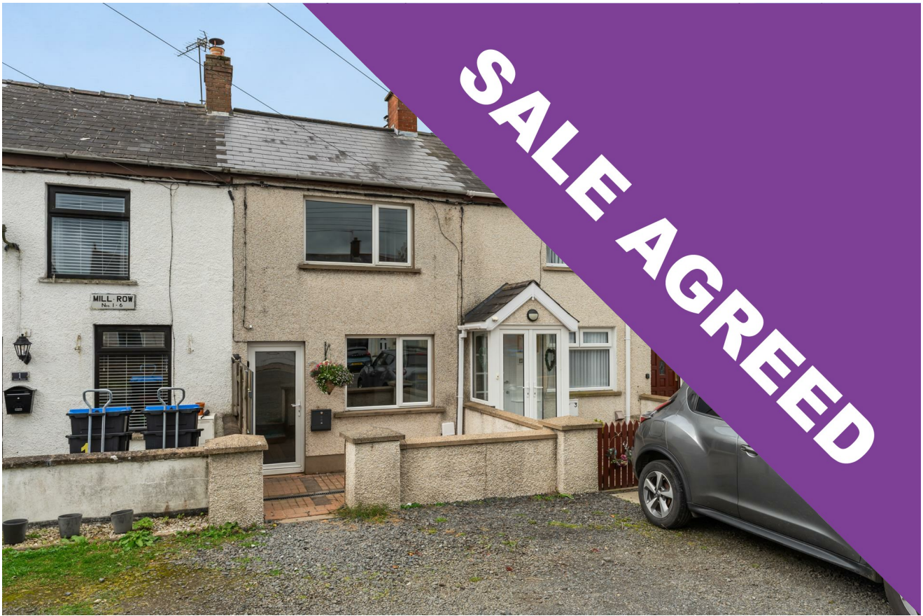
2 Mill Row, Doagh, BT39 0PN