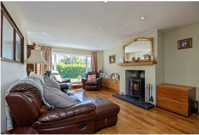
Cats iron wood burning stove, heats up water. Wooden mantle. Timber flooring. Spotlights.