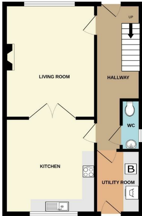
GROUND FLOOR 471 sq.ft. (43.8 sq.m.) approx.