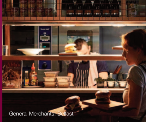
General Merchants, Belfast