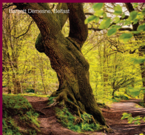
Barnett Demesne, Belfast