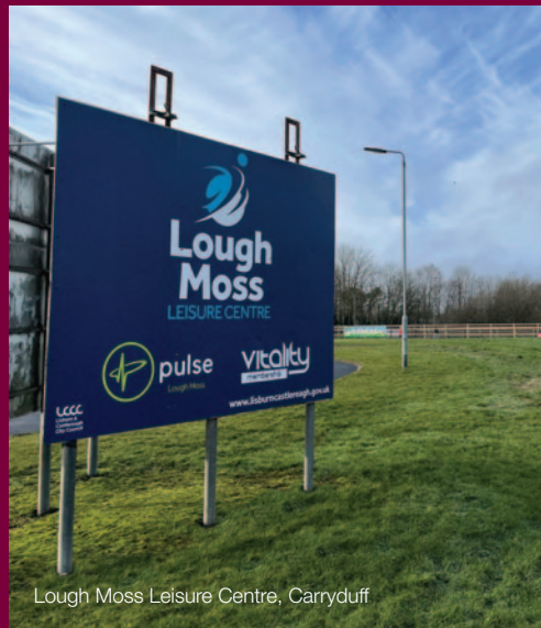
Lough Moss Leisure Centre, Carryduff