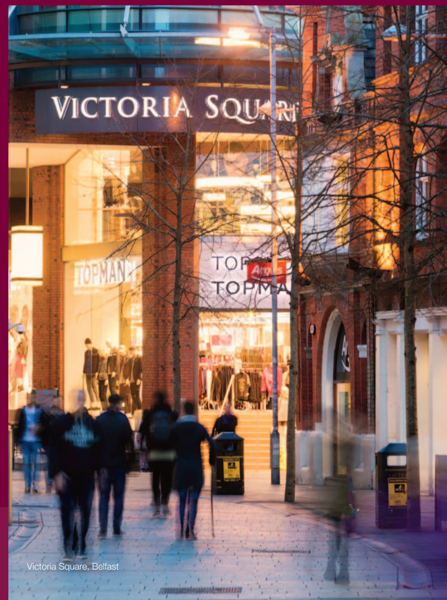
Victoria Square, Belfast