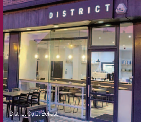
District Café, Belfast