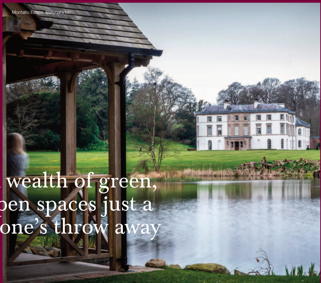
Montalto Estate, Ballynahinch

A number of fantastic local parks are positioned nearby, including Belvoir Forest Park, Barnett Demesne and the highly regarded Sir Thomas and Lady Dixon Park. What's more, thanks to the popular Forestside Shopping Centre situated just a short drive away, not forgetting the wealth of shopping opportunities available at Belfast's City Centre, homeowners can experience the very best in local retail facilities.