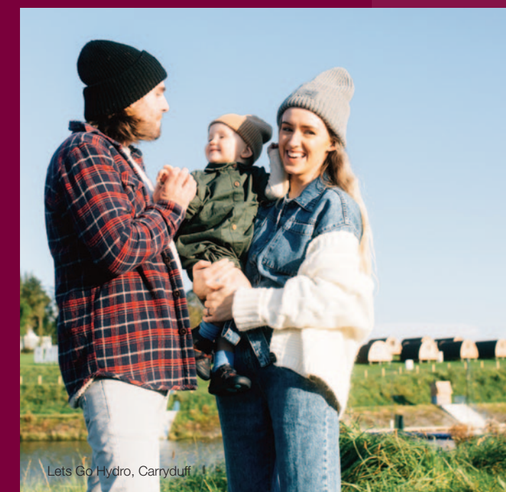
Lets Go Hydro, Carryduff