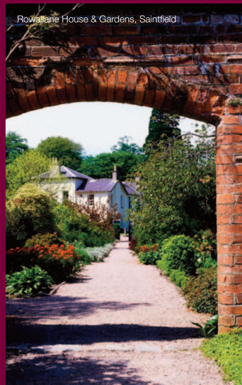
Rowallane House & Gardens, Saintfield