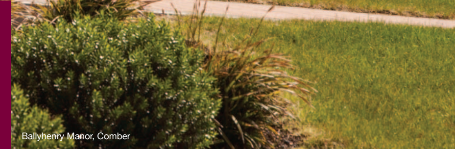
Ballyhenry Manor, Comber