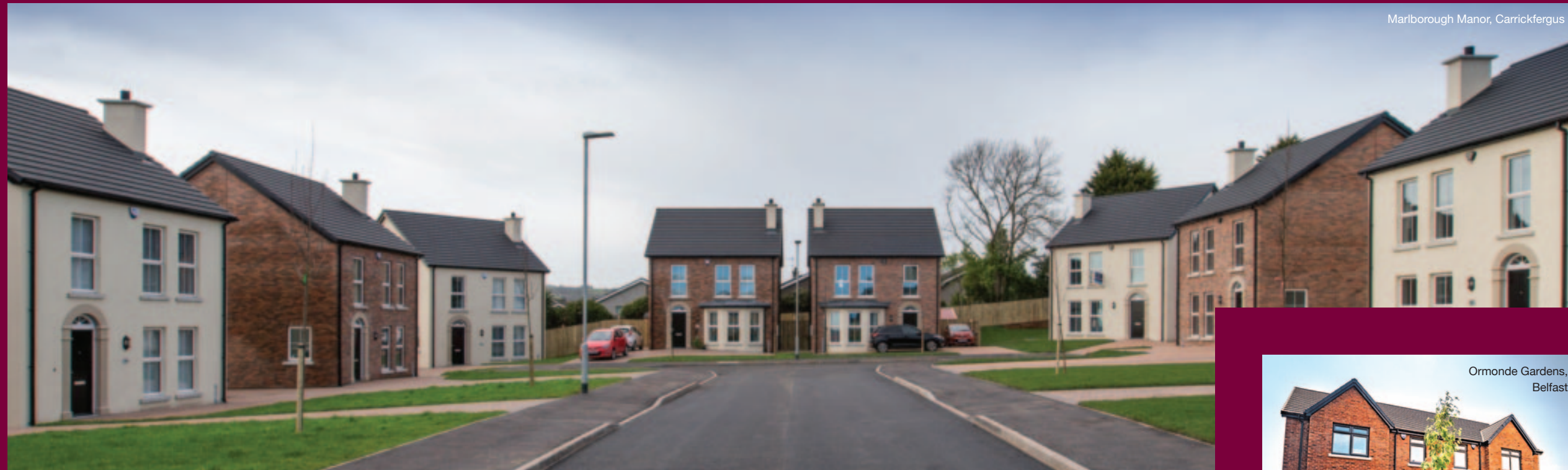
Marlborough Manor, Carrickfergus