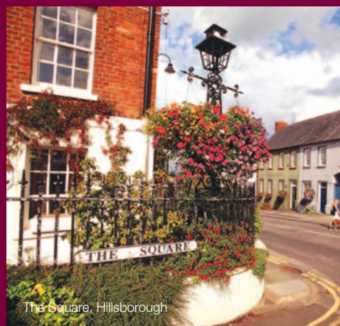
The Square, Hillsborough