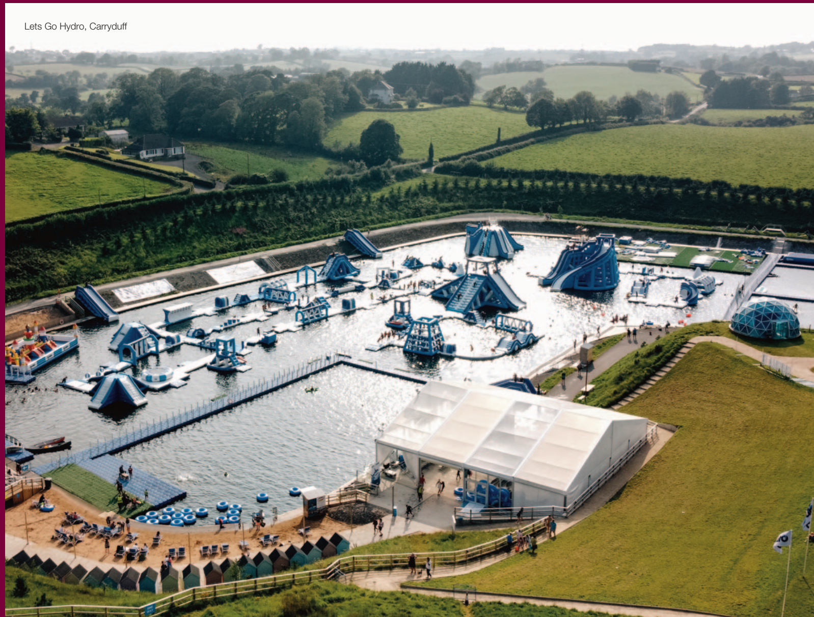
Lets Go Hydro, Carryduff