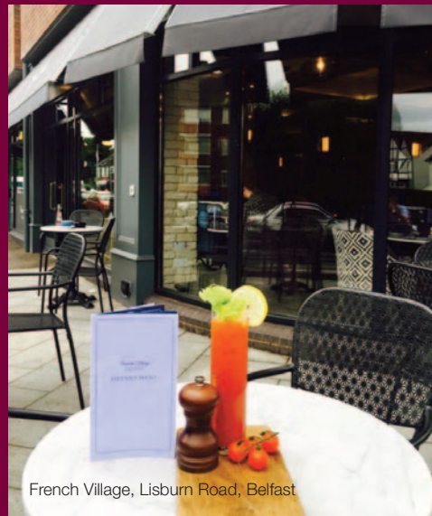
French Village, Lisburn Road, Belfast