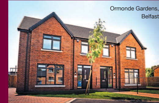
Ormonde Gardens, Belfast