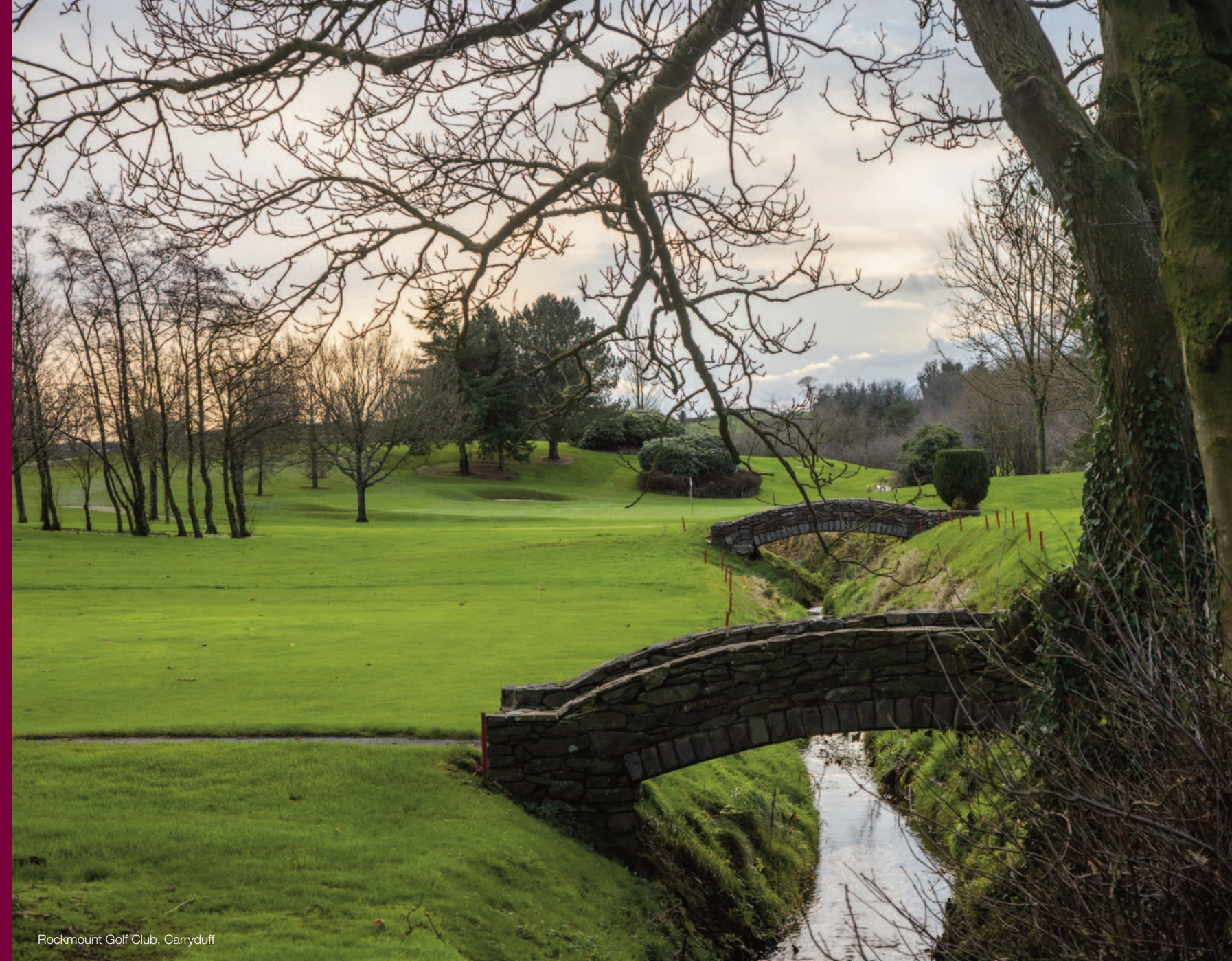
Rockmount Golf Club, Carryduff