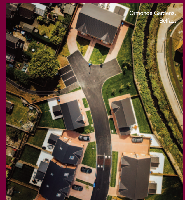
Ormonde Gardens, Belfast