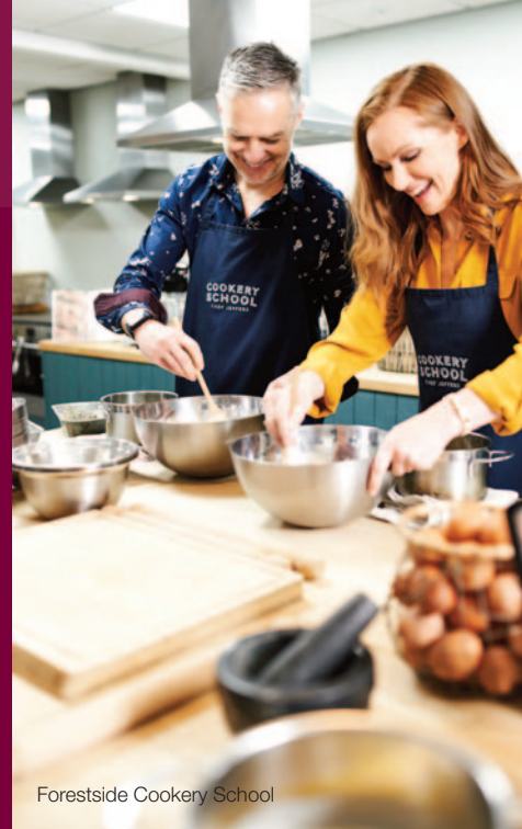
Forestside Cookery School