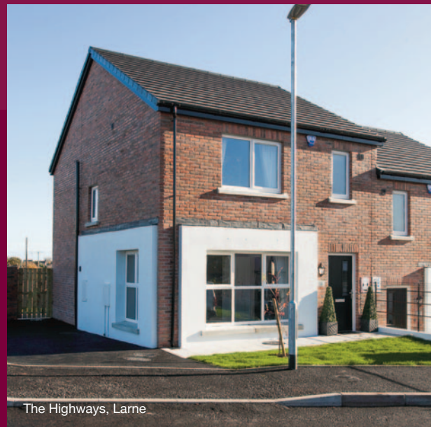
The Highways, Larne