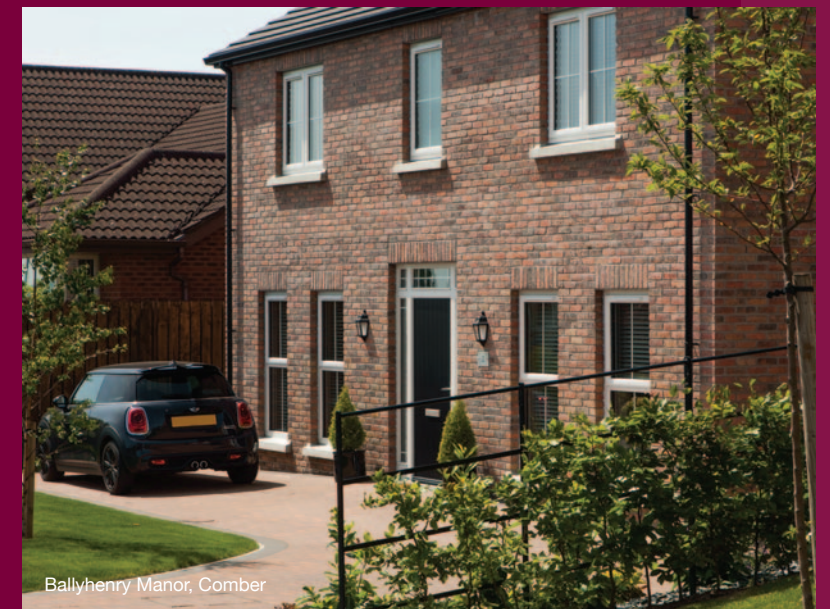
Ballyhenry Manor, Comber

Traditional designs, built to the highest standards, in key locations. We recognise that our customers are at the core of our business and therefore, pride ourselves on providing the highest levels of customer service. You will be proud to call your home a Rosemount Home.