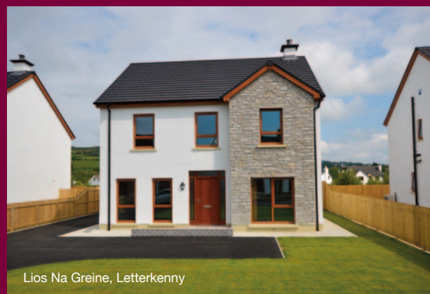
Lios Na Greine, Letterkenny