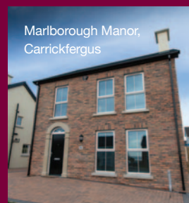
Marlborough Manor, Carrickfergus

We pride ourselves on our company values; Trust, Respect, Caring, Being Open, and Honest.