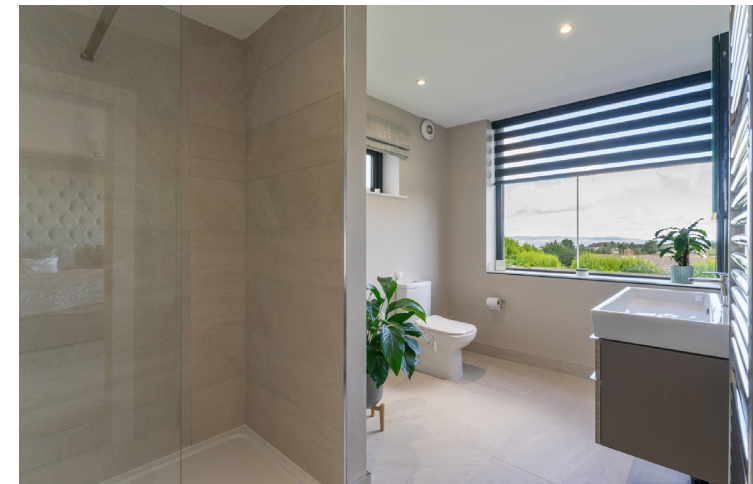
Luxury ensuite shower room

Enclosed PVC oil tank. Outside light. Outside tap.