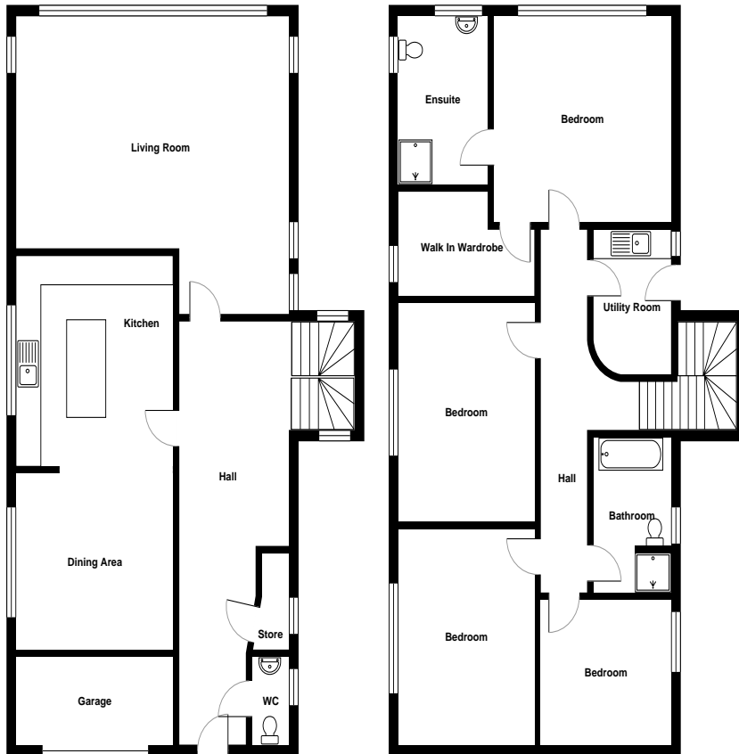
Total Area: 213.3 m 2 ... 2296 ft 2 All measurements are approximate and for display purposes only