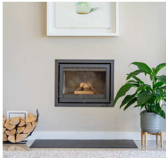
Feature glass fronted fireplace