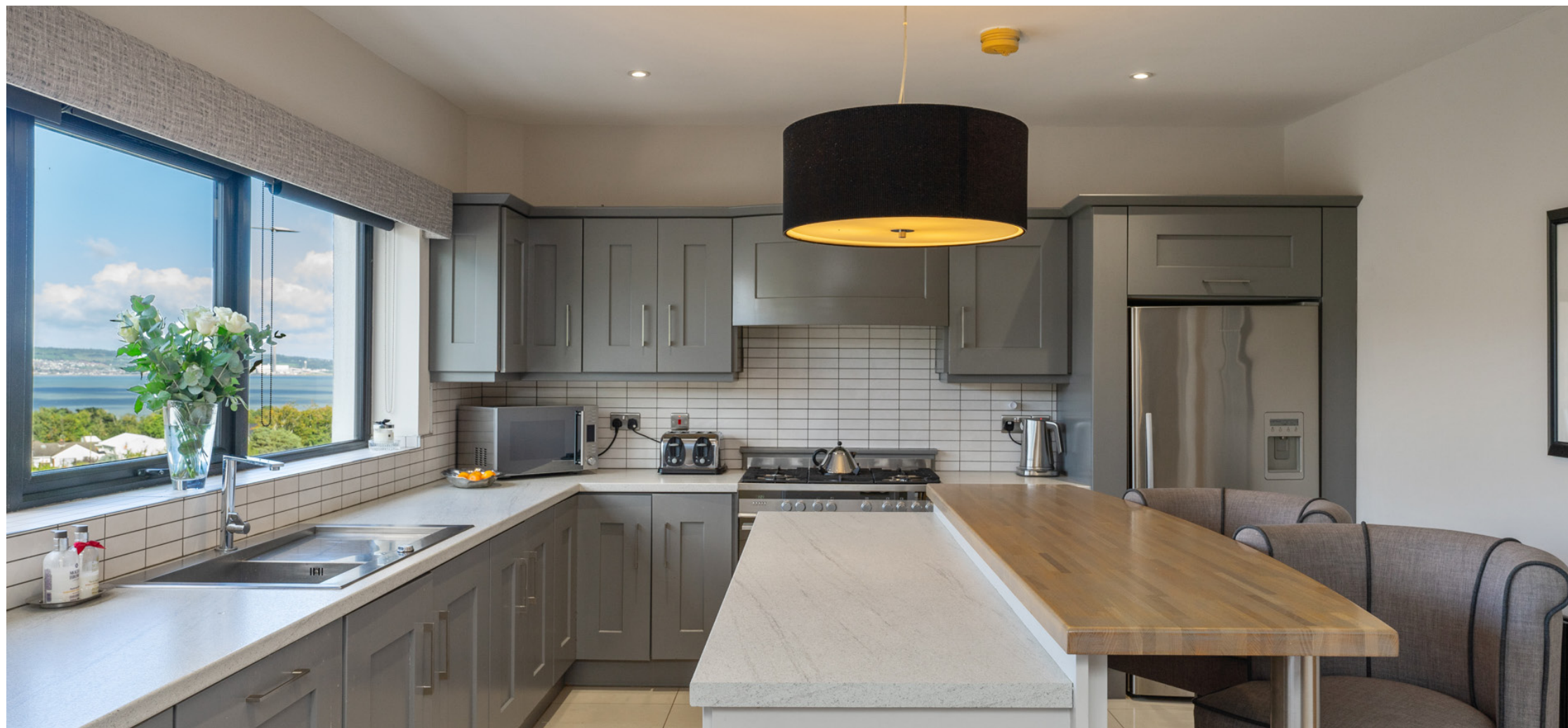
Luxury kitchen opening to dining