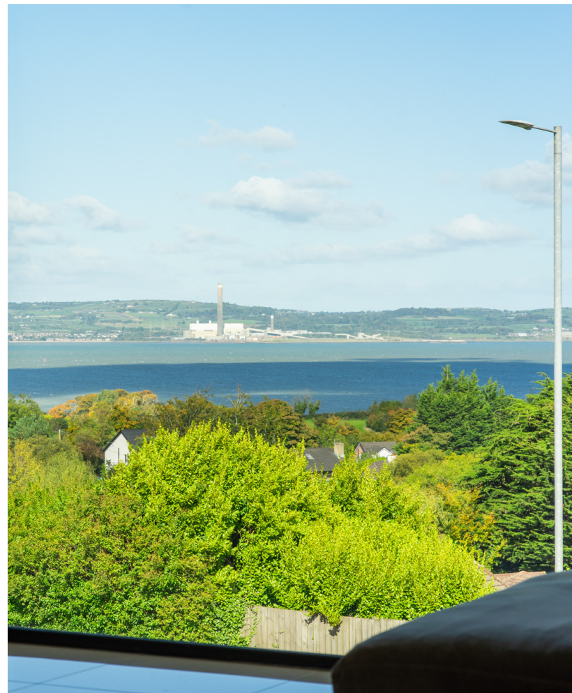
View from the drawing room