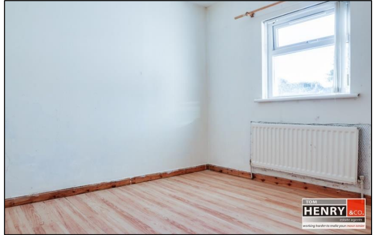
BEDROOM 3: TO SIDE. PRE-FINISHED FLOOR. HOTPRESS: SHELVED.