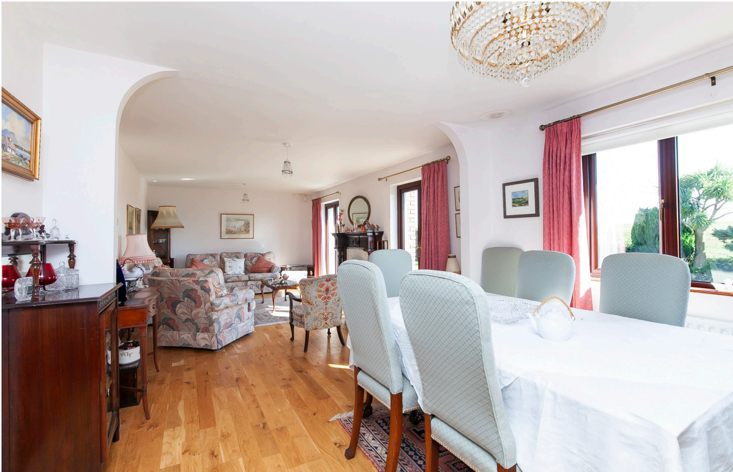
Dining through to Drawing room