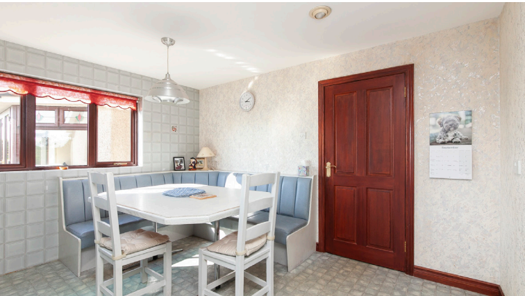
Casual dining area