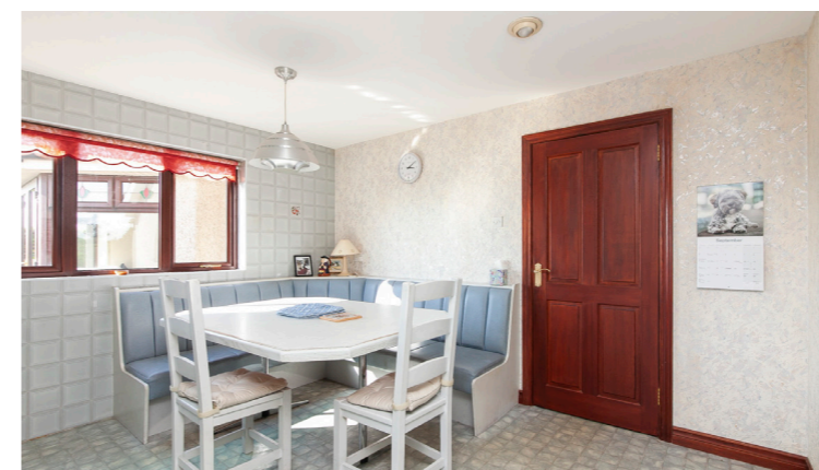
Casual dining area