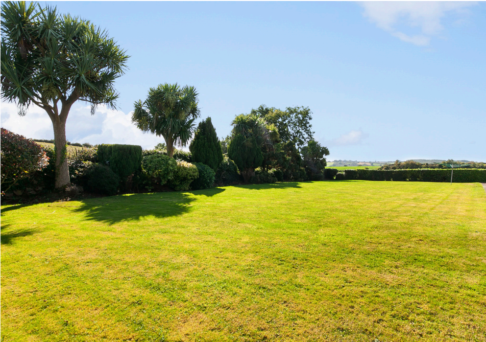
Sunny rear garden with rural views to Scrabo Tower

Travel 0.5 mile up Crawfordsburn Road from junction with Hardford Link and turn left into Tullynagardy Road. Travel a further 0.3 mile and turn left into a small cul-de-sac. Number 32 is on left hand side.