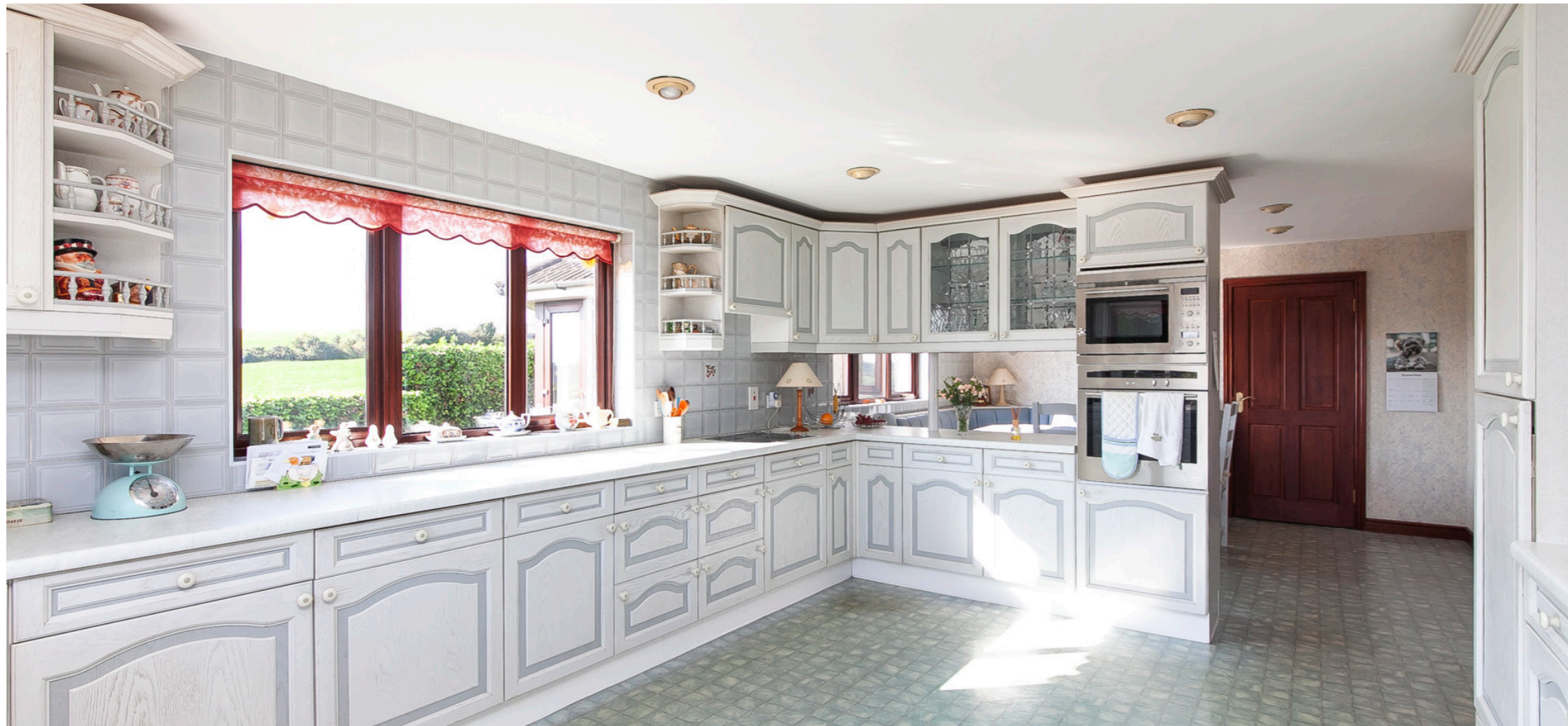
Large Kitchen leading to breakfast area