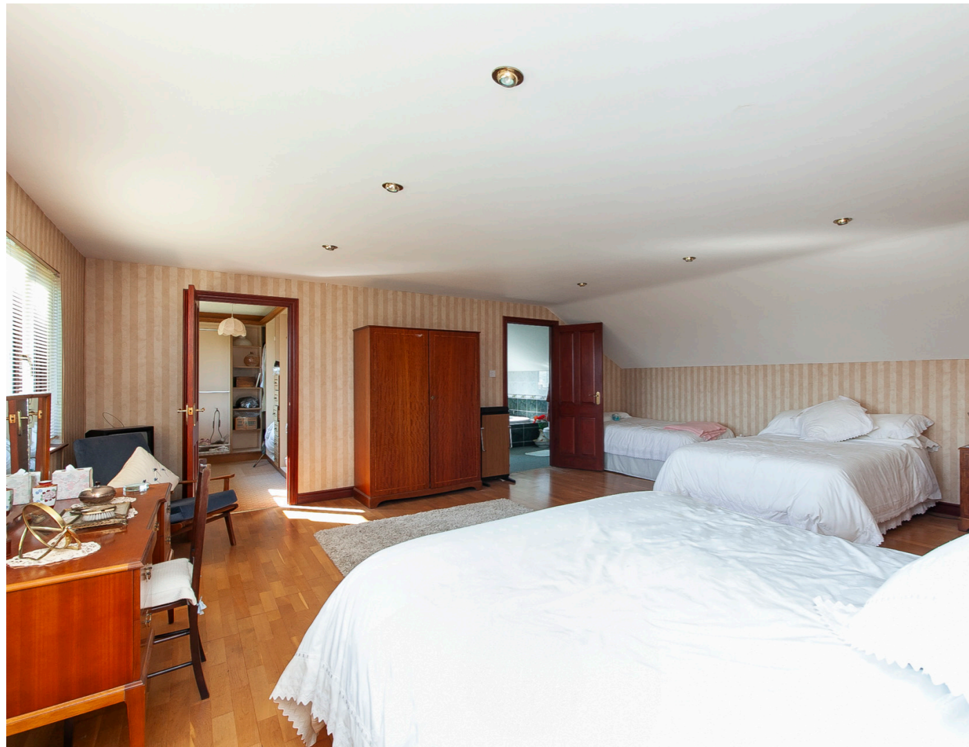
Main bedroom first floor

BEDROOM (3) 12' 3" x 8' 10" (3.73m x 2.69m) Views to front garden.