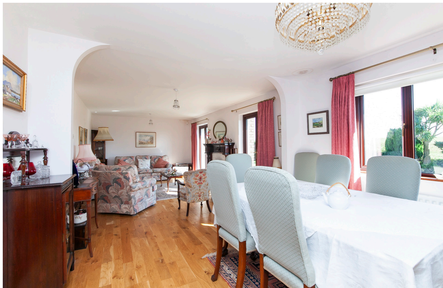
Dining through to Drawing room