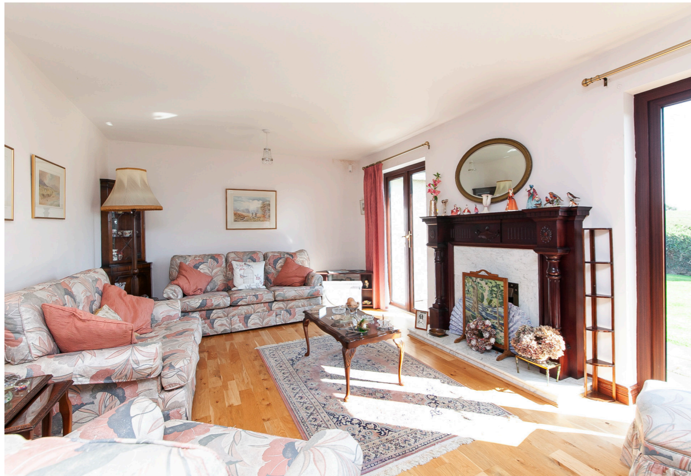
Drawing room leading to gardens