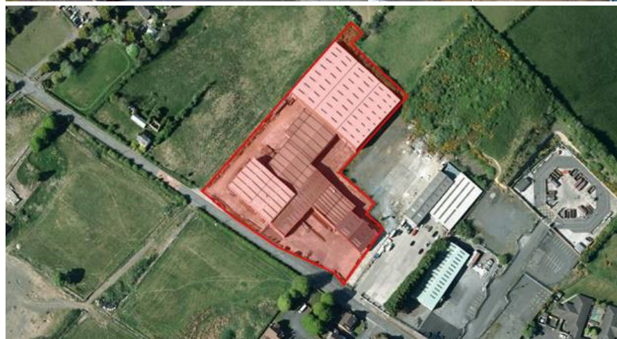
Not To Scale. For indicative purposes only.

For Sale/To Let Substantial Industrial Facility c. 7,220 m 2 (77,750 ft 2 ) 51 Lisburn Road, Ballynahinch BT24 8TT