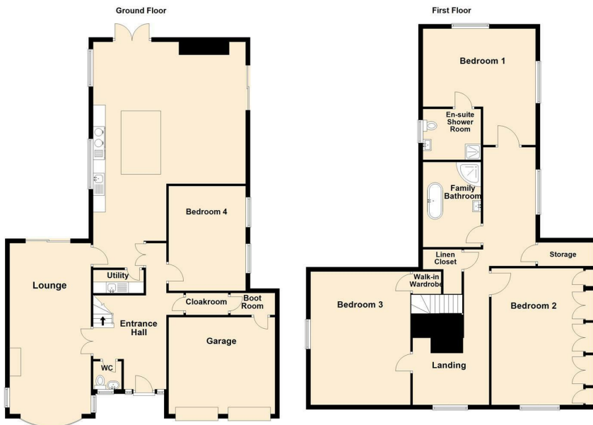
6A Old Cultra Road, Holywood

HMK Property have endeavoured to prepare these sales particulars as accurately and reliably as possible for the guidance of intending purchasers or lessees. These particulars are given for general guidance only and do not constitute any part of an offer or contract. The seller and agents do not give any warranty in relation to the property. We would recommend that all information contained in this brochure is verified by yourself or your professional advisors. Services, fittings, and equipment referred to in the sales details have not been tested and no warranty is given to their condition. All measurements contained within this brochure are approximate.